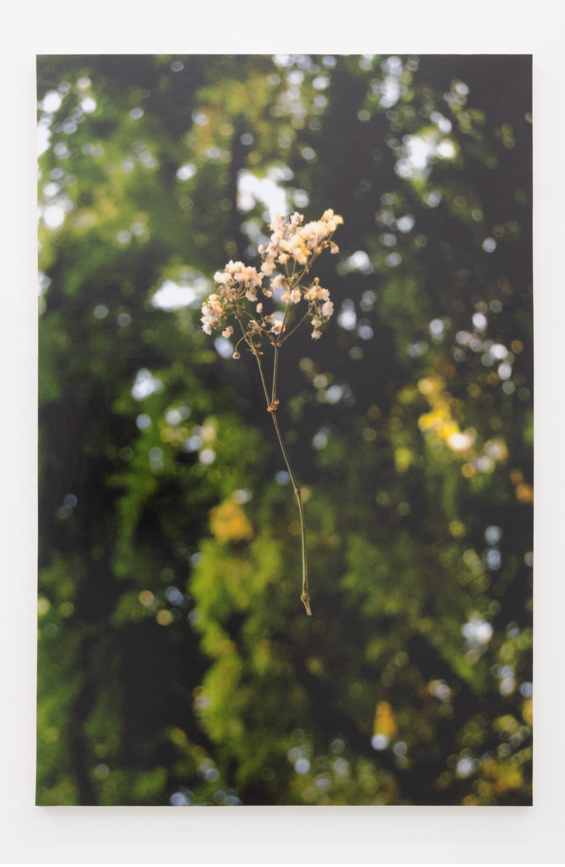
Baby's Breath, 2025 Inkjet print on wood panel 27.5" x 41.5" x1.25" Edition of 3