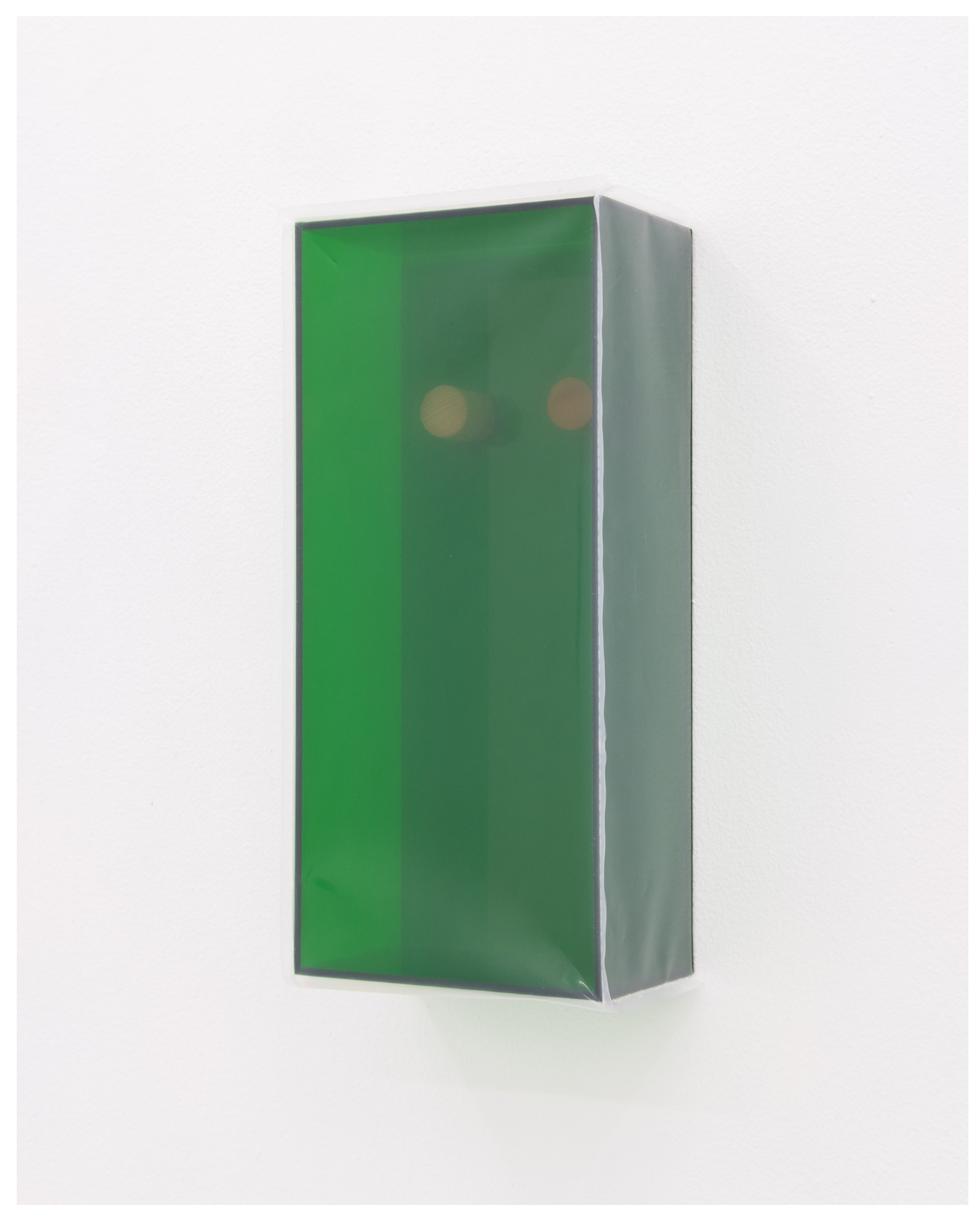
Potted Plant #3, 2025 Acrylic with polyethylene cover, wood, hardware 5" x 10.75" x 3.25"