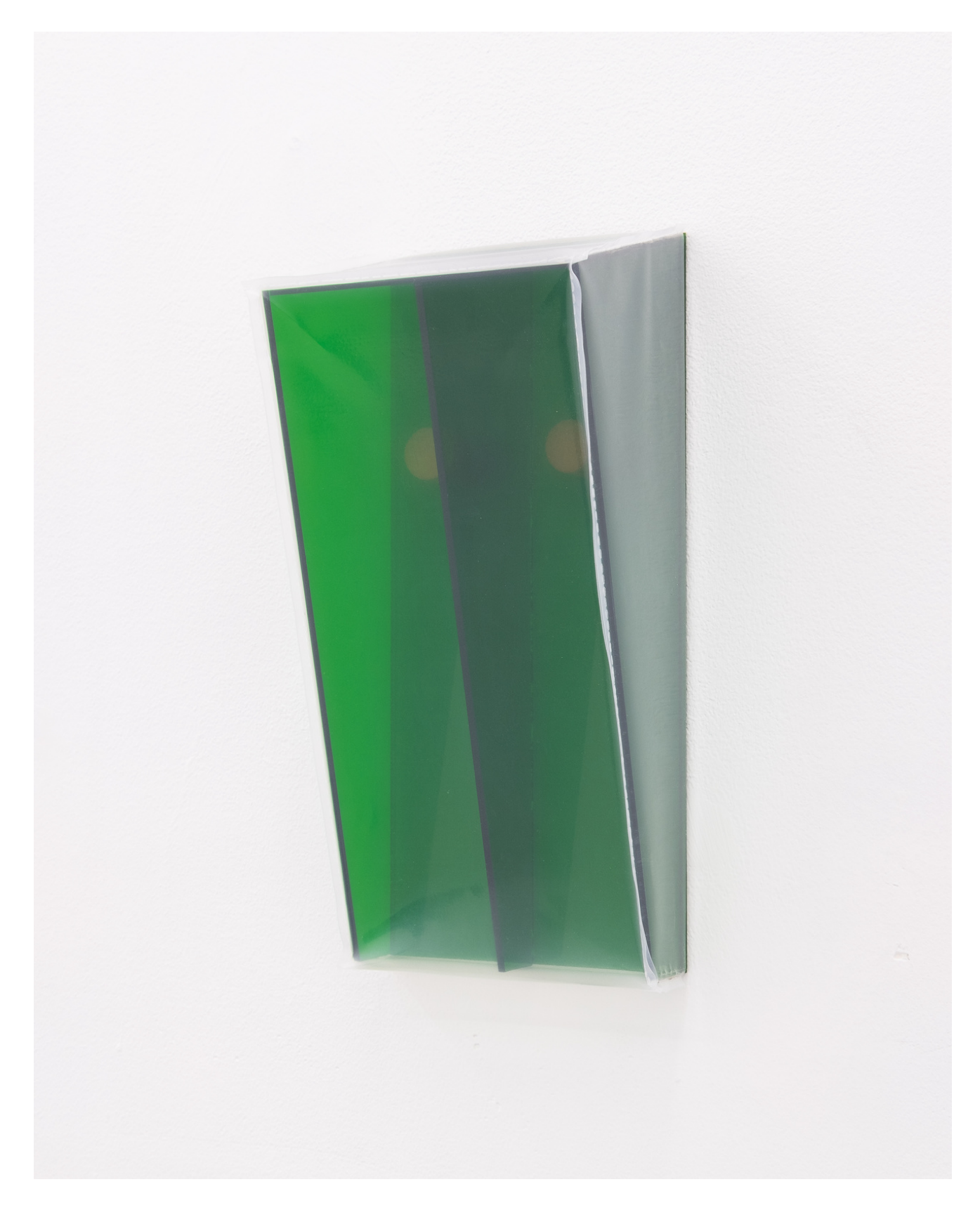
Potted Plant#2, 2025 Acrylic with polyethylene cover, wood, hardware 5" x 10.5" x 3.75"