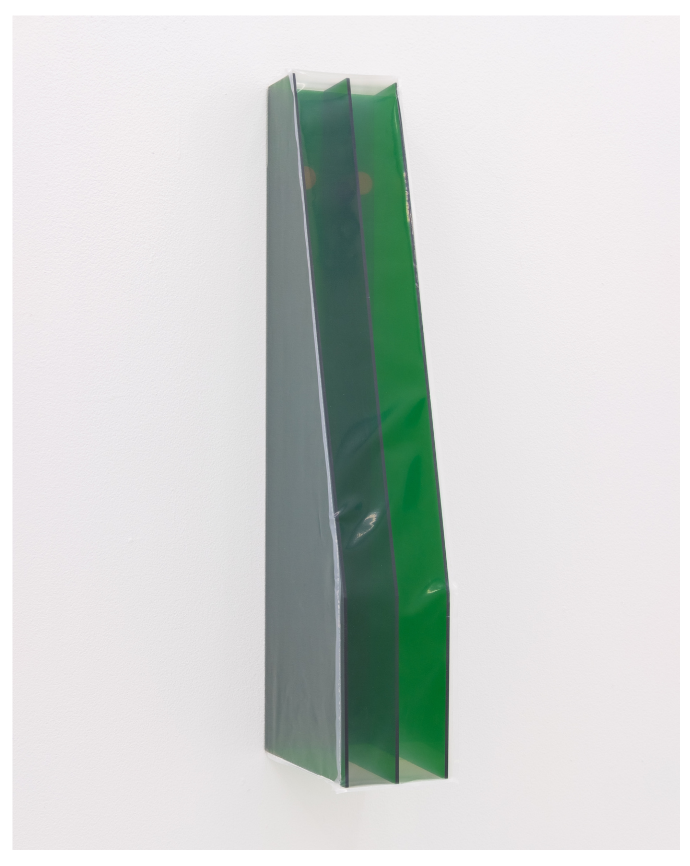
Potted Plant #1, 2025 Acrylic with polyethylene cover, wood, hardware 3.75" x 22" x 6.5"