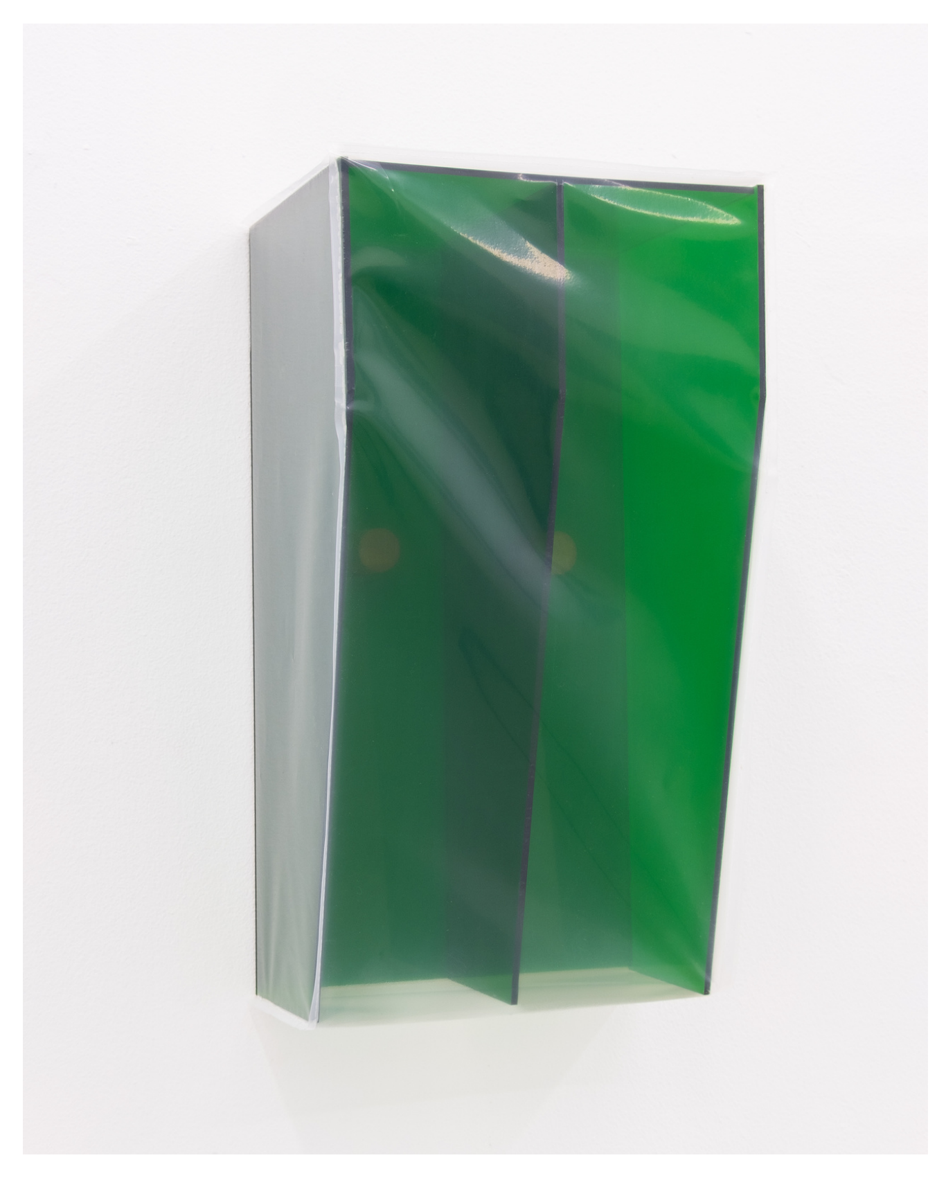
Potted Plant (Donald), 2025 Acrylic with polyethylene cover, wood, hardware 7" x 13" x 5.5"