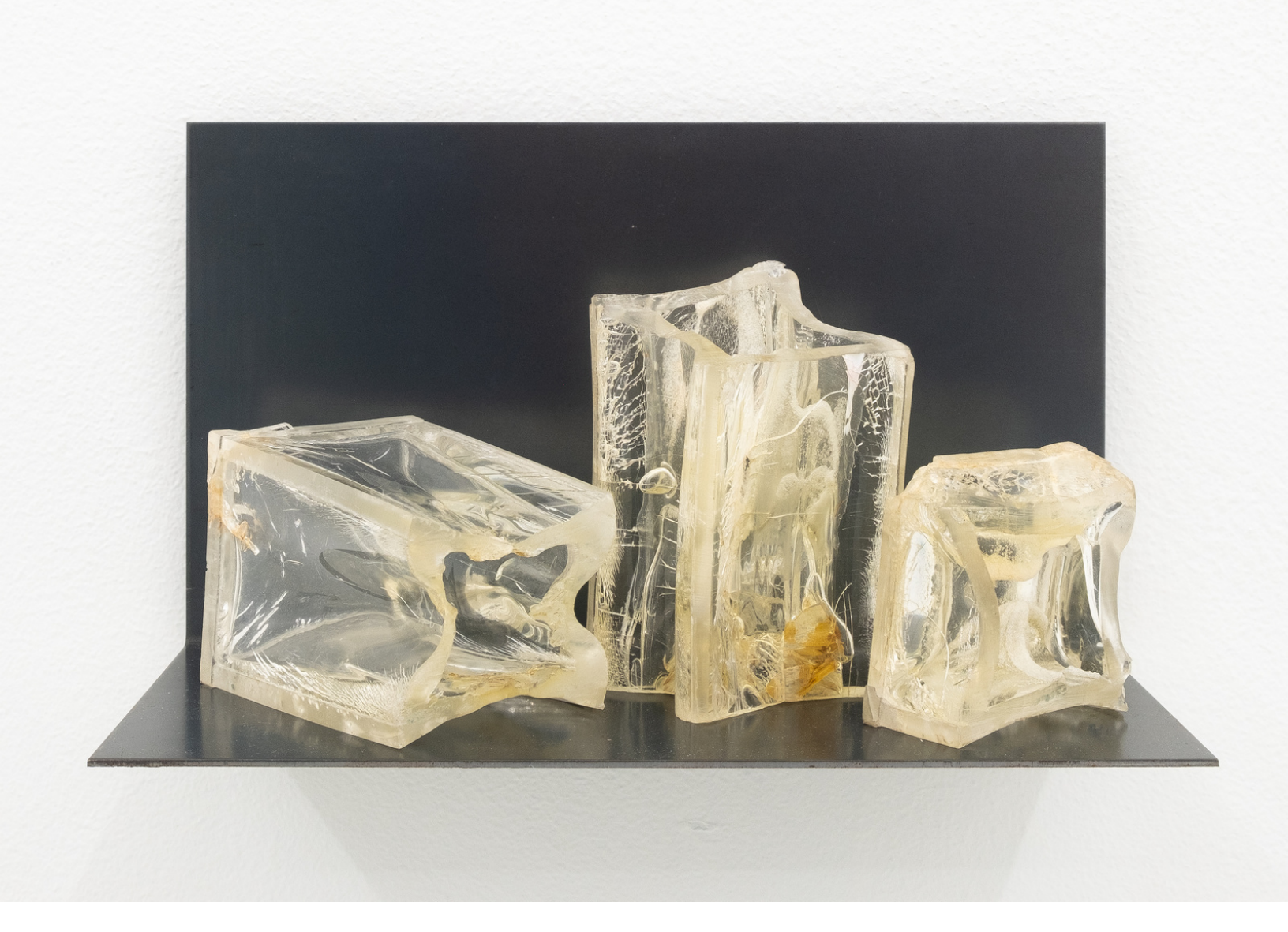
Spirit Collection (yellow), 2017/2025 Acrylic on steel shelf 8.25" x 4.75" x 4.5"