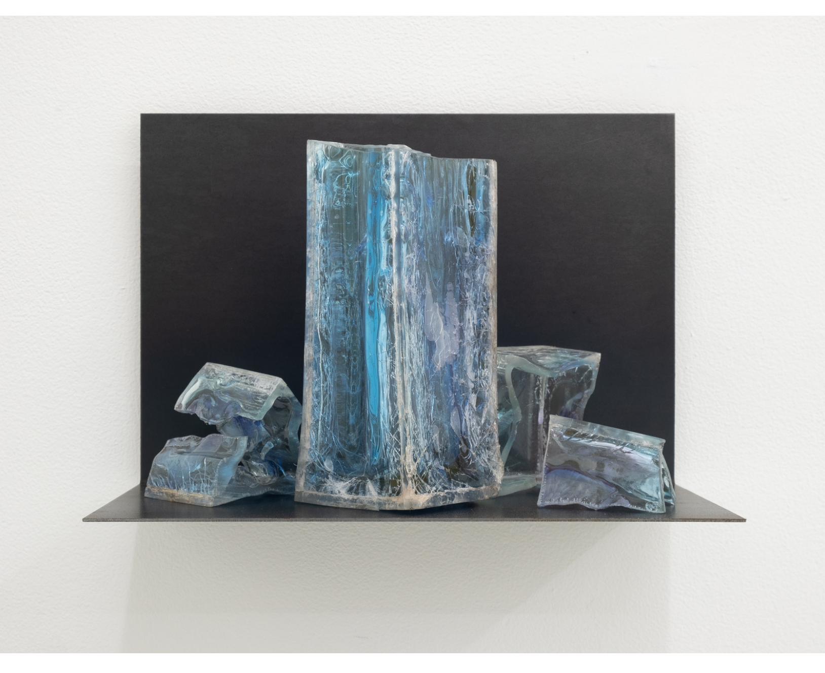
Spirit Collection (blue), 2017/2025 Acrylic on steel shelf 11" x 7.5" x 6.25"