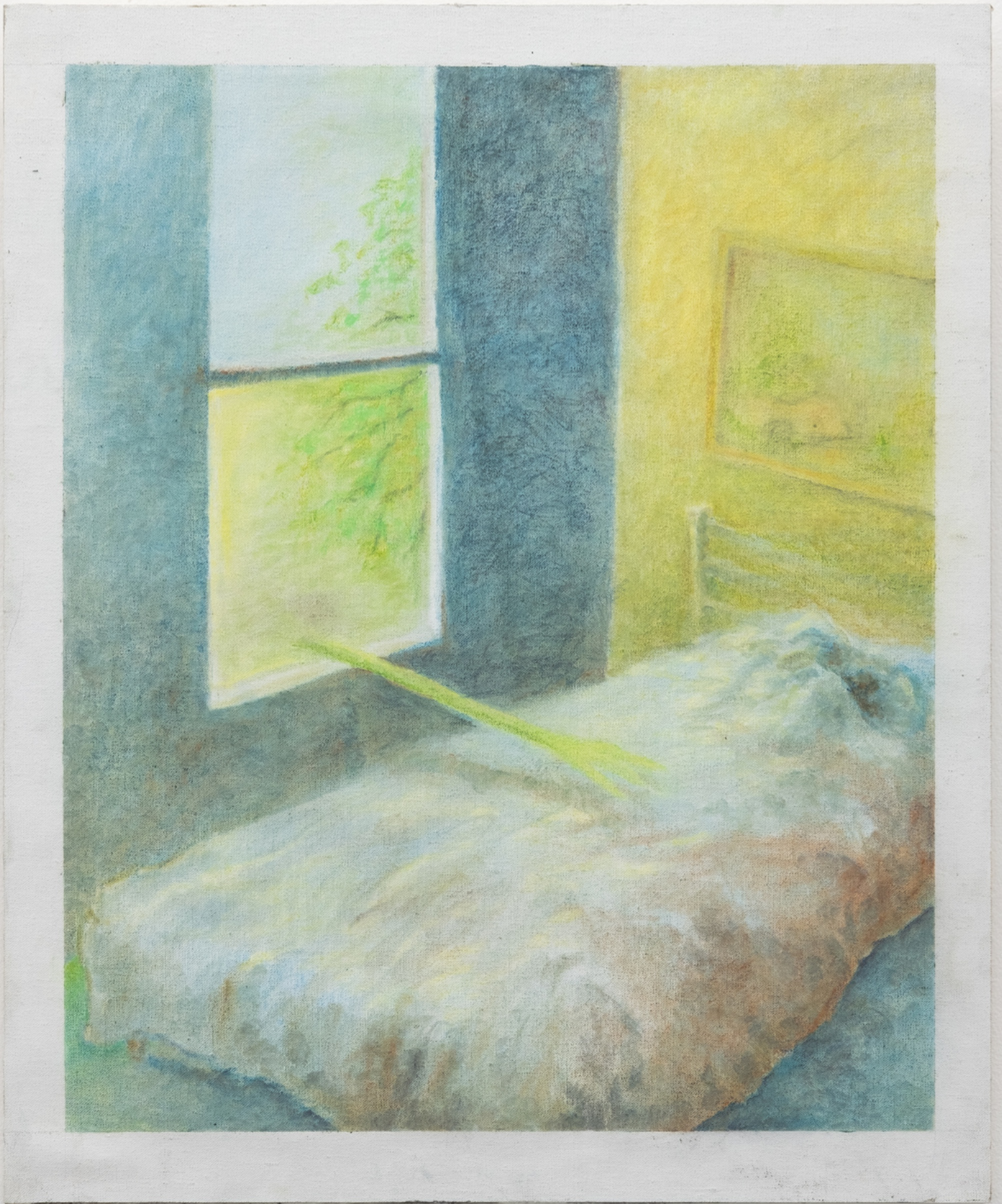
San Diego Window , 2022 Pastel on mounted canvas 20 x 24 1/4 in