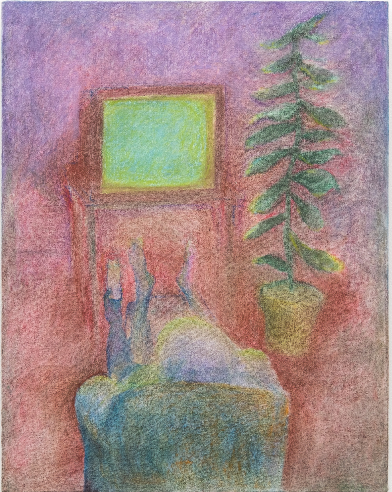
Glow , 2023 Pastel on mounted canvas 20 x 24 1/4 in