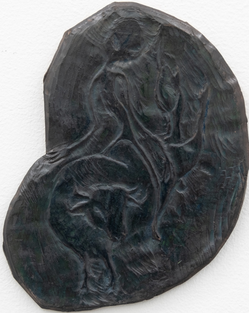
Spaghetti Rider , 2024 Terracotta and graphite 6 1/4 x 8 in