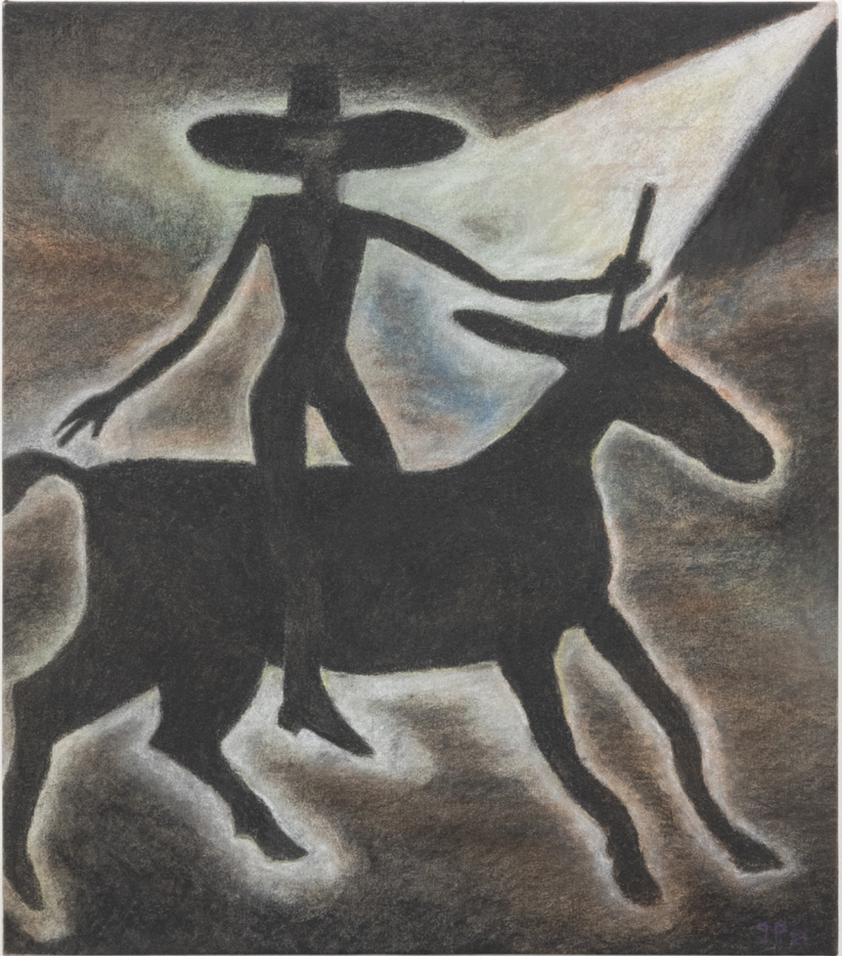
Rider and Beast , 2023 Chalk pastel on canvas 25 x 22 in