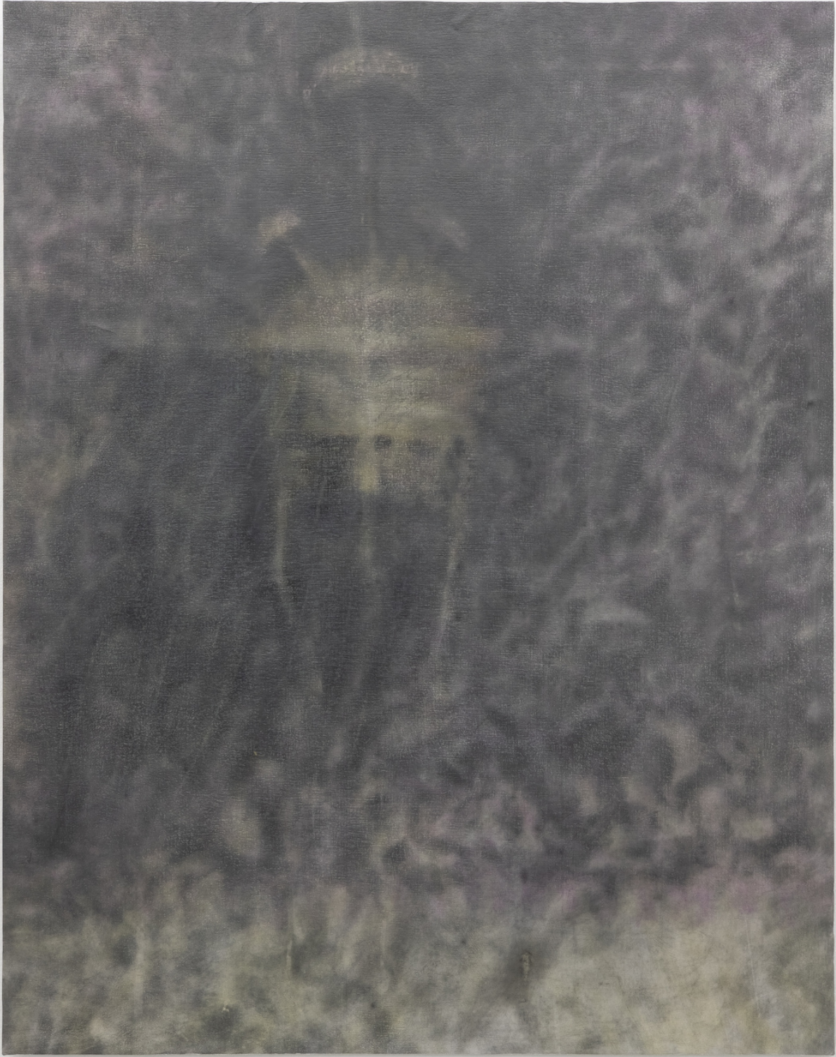
Entity in Wooded Area, 2024 Graphite on canvas 24.5 x 31 in