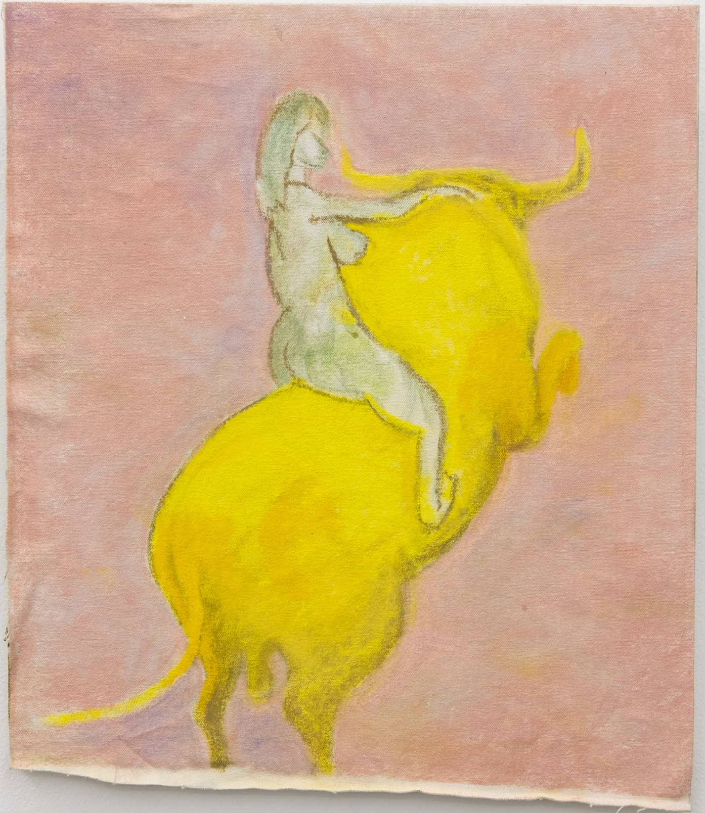
Europa , 2024 Pastel on mounted canvas 15 1/2 x 19 in