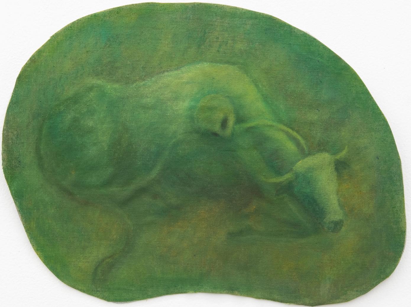
Dull Eyes, 2024 Pastel on mounted canvas 18 x 13.5 in