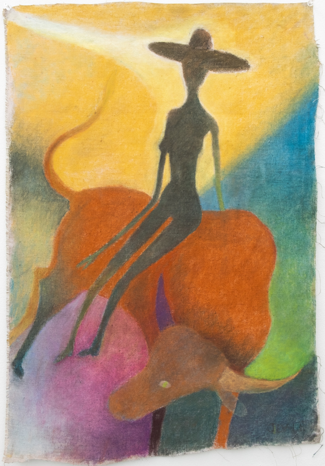
Pekid Pale Bull and Rider with Lilac Ginger Honey Lemon, 2023 Chalk pastel on mounted canvas 24 3/8 x 32 1/4 in (framed)