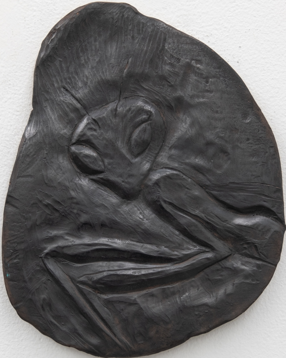
Mantis , 2024 Terracotta and graphite 8 x 10 in