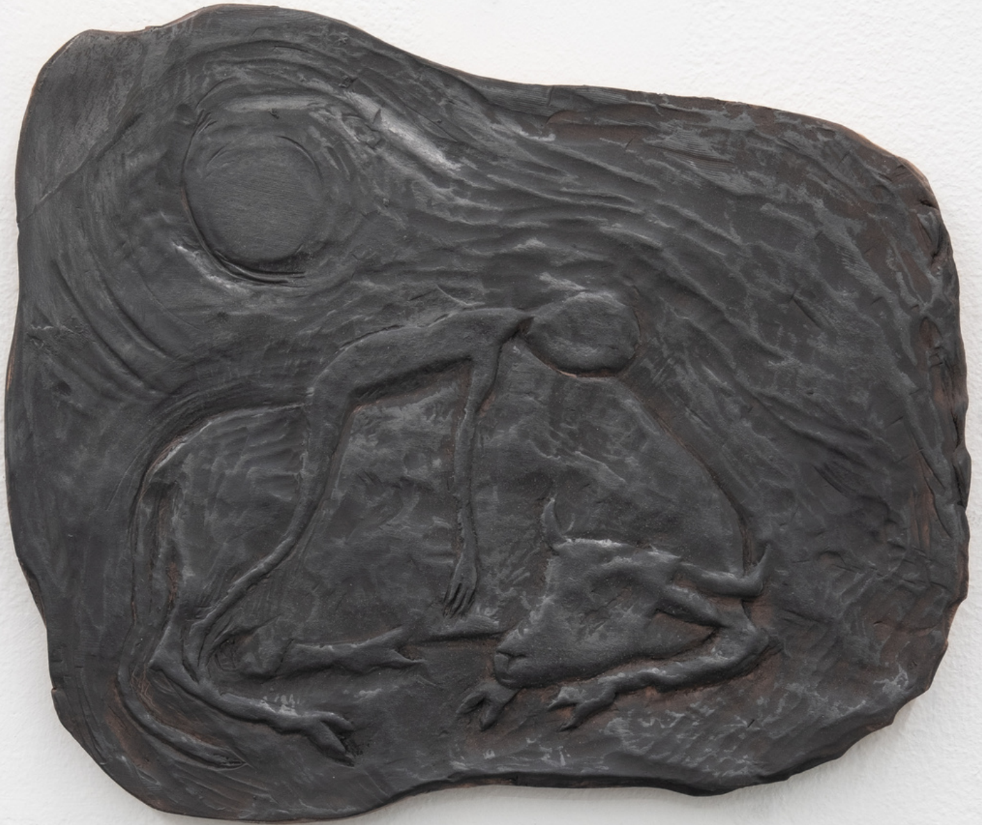
Kandinsky Green , 2024 Terracotta and graphite 11 x 9 1/4 in