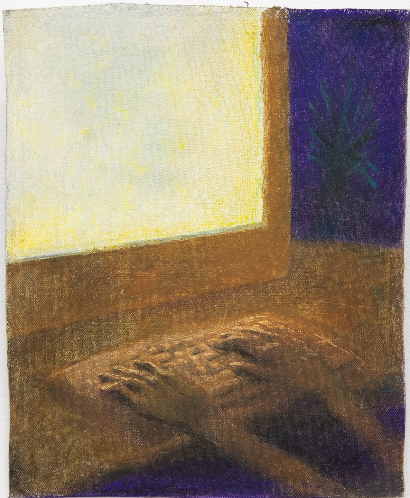
Green Light , 2024 Pastel on mounted canvas 11 1/4 x 14 in