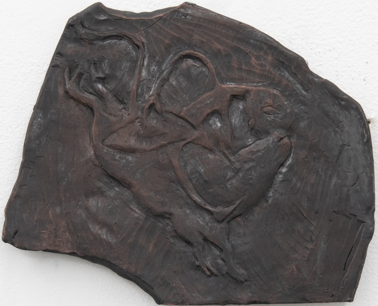
Rider and Bull, 2024 Terracotta and graphite 9 3/4 x 14 in