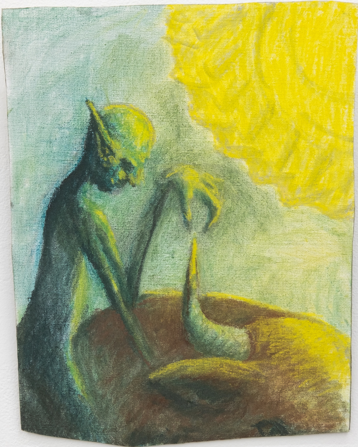
Cobold , 2024 Pastel on mounted canvas 11 1/4 x 14 in