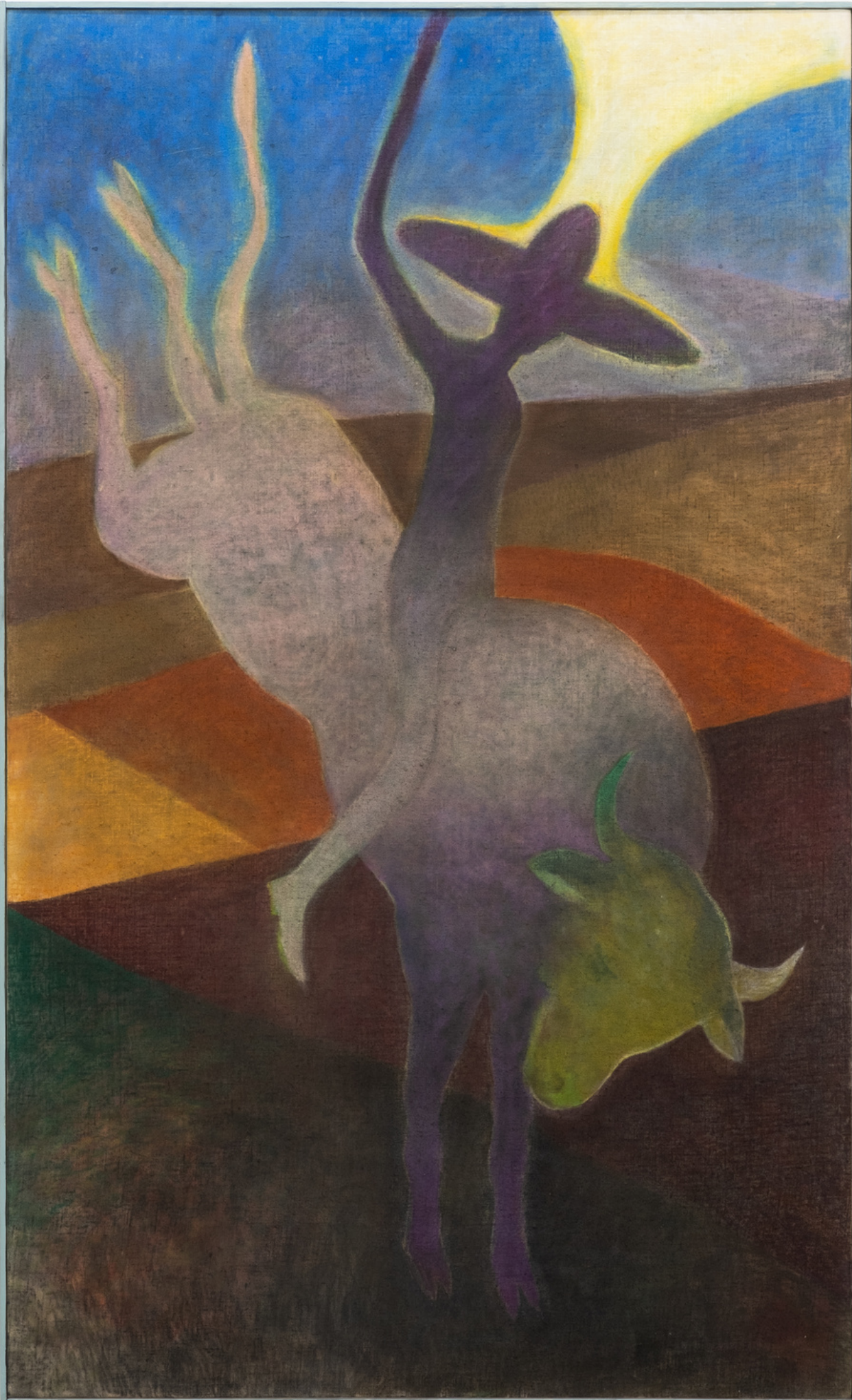
Pekid Phenom and the Bull, 2023 Chalk pastel on mounted canvas with artist frame 48 x 79 in (framed)