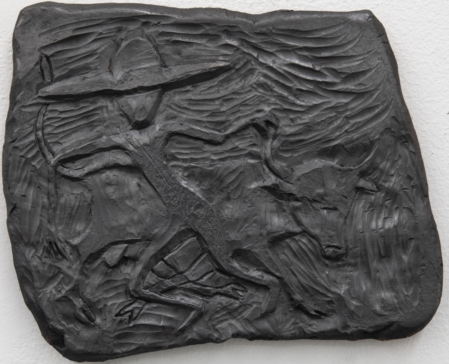
Pinch, 2024 Terracotta and graphite 9 1/4 x 7.5 in