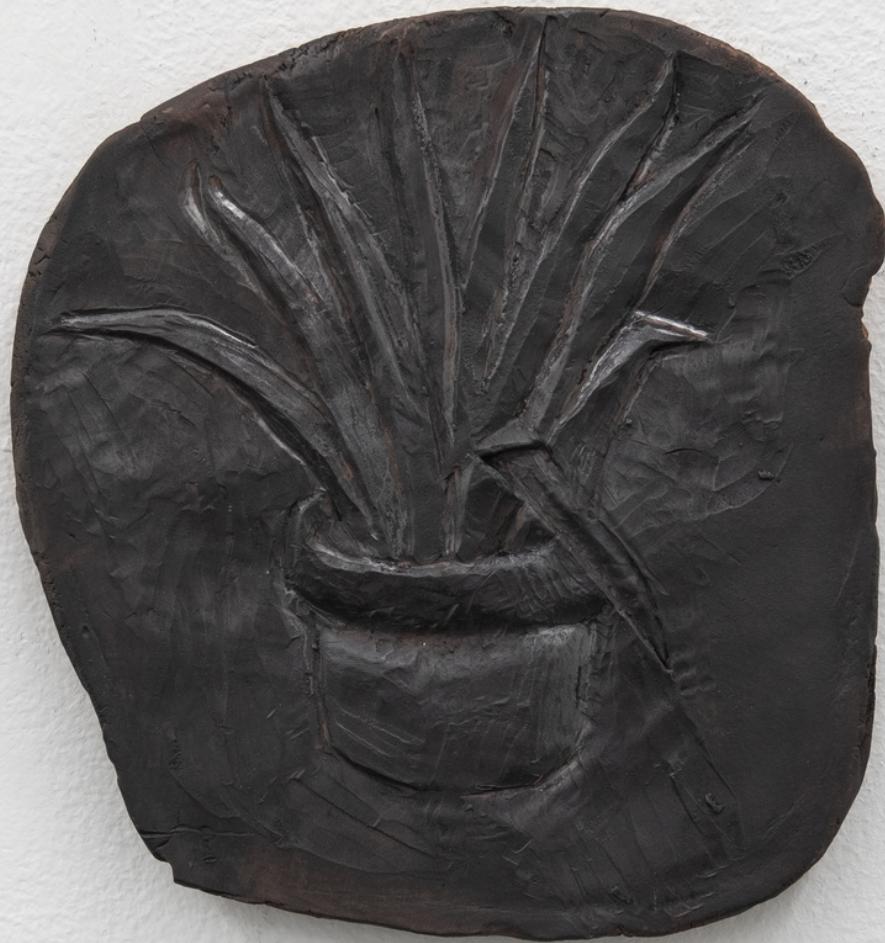
Snake Plant , 2024 Terracotta and graphite 6 3/4 x 7 1/4 in