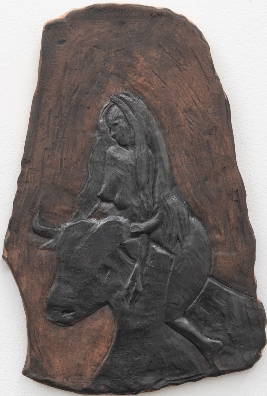
Europa no. 2, 2024 Terracotta and graphite 11.5 x 14 in