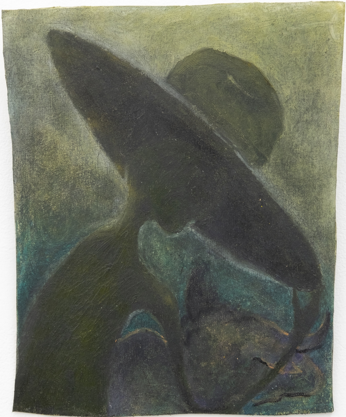
The Gentleman, 2024 Mixed media on mounted canvas 11 1/4 x 14 in