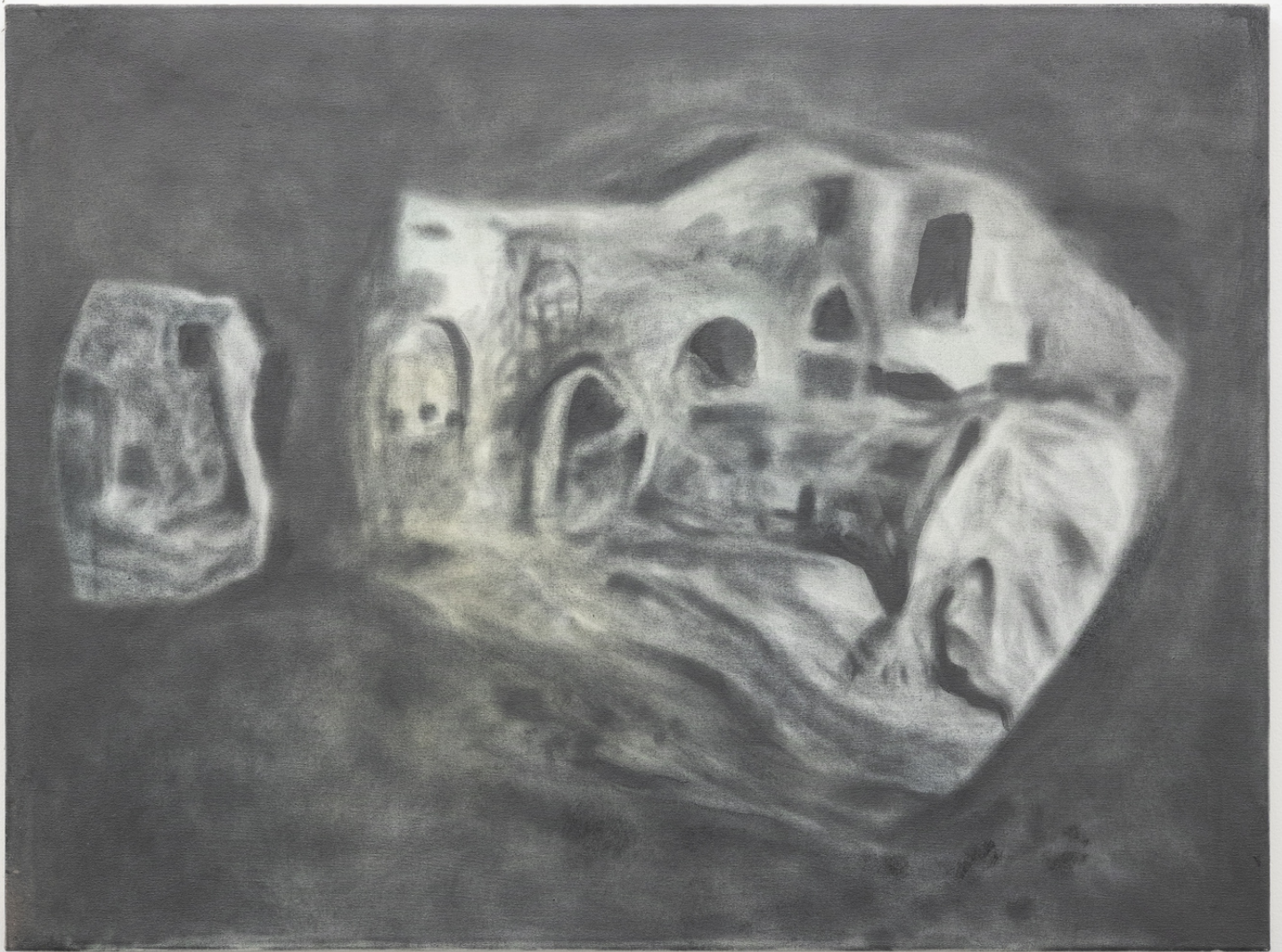
Cappadoccia no.2 , 2024 Graphite on canvas 39 3/4 x 29 3/4 in