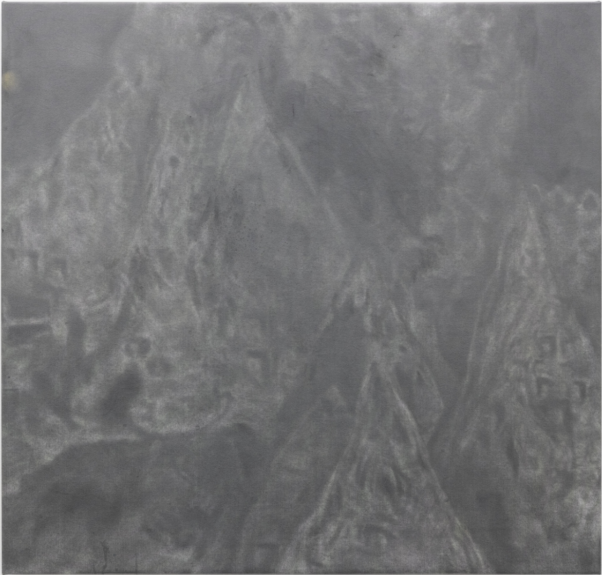
Cappadoccia , 2024 Graphite on canvas 46 x 44 in