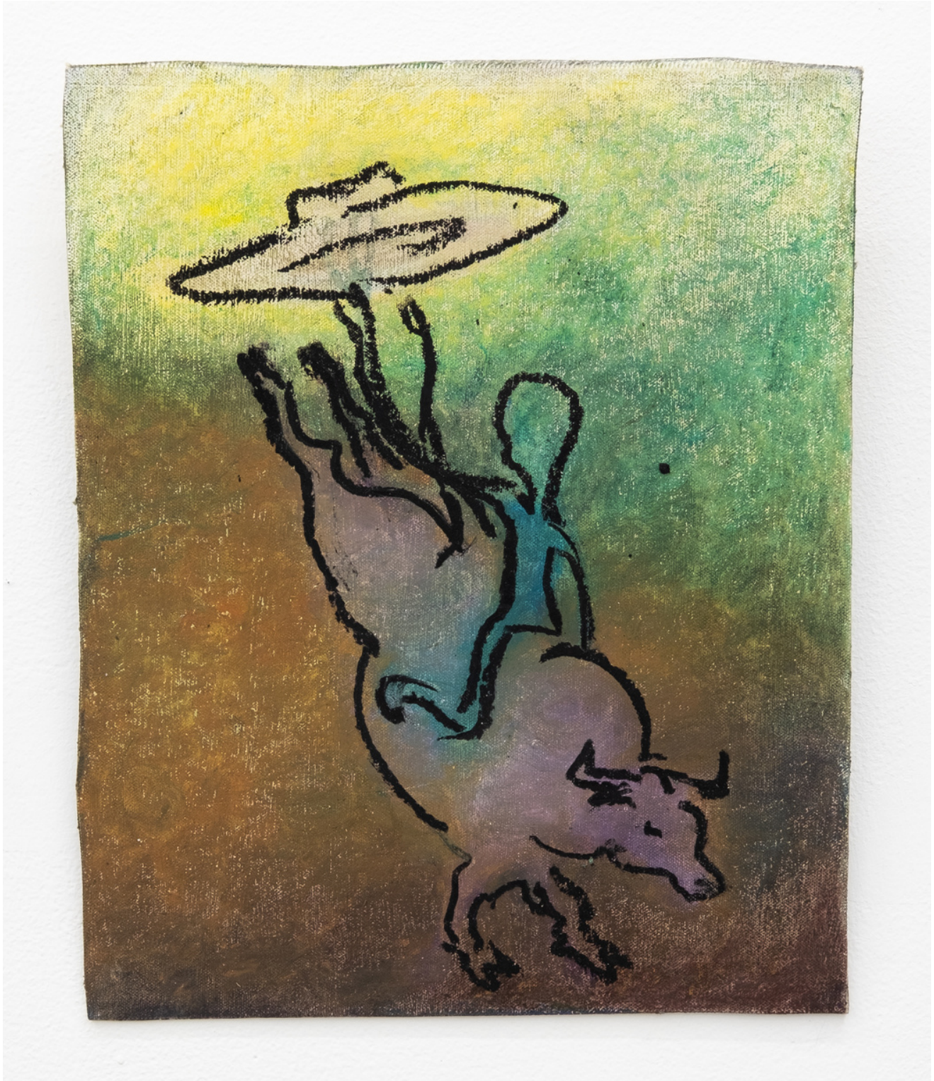
The Hat , 2024 Pastel on mounted canvas 11 1/4 x 14 in