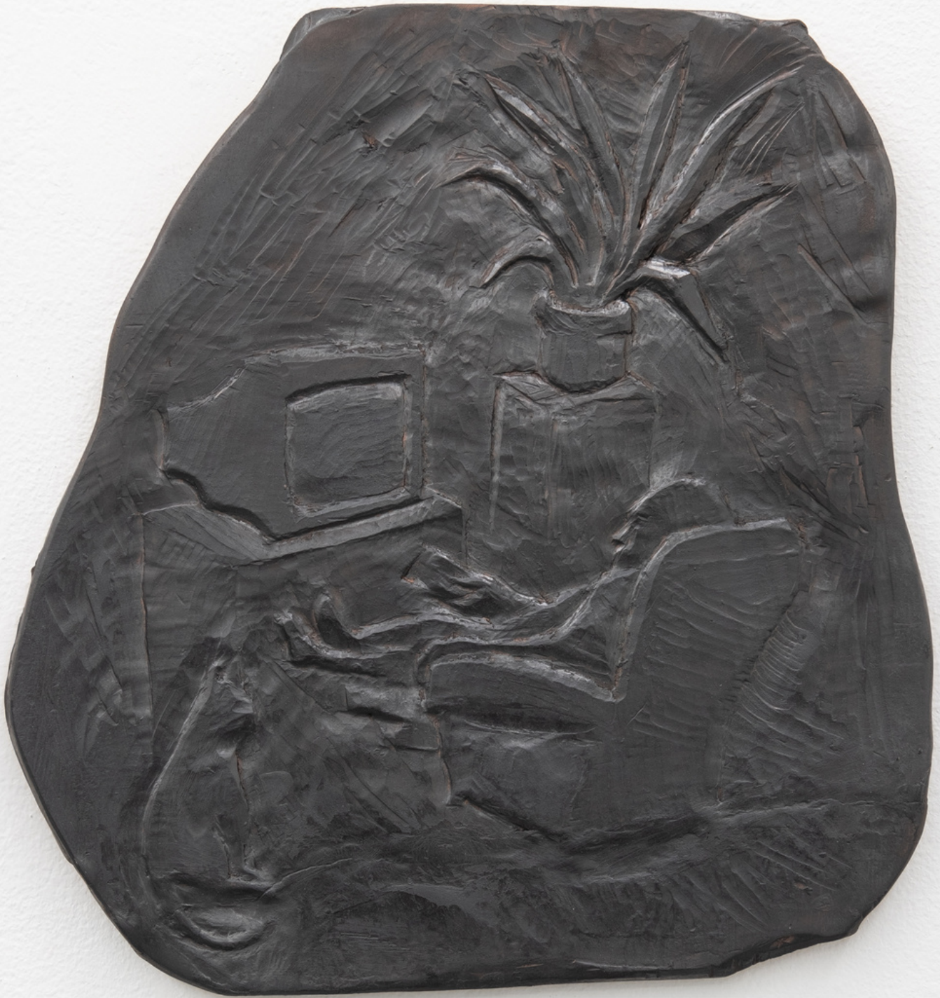
TV Time, 2024 Terracotta and graphite 11.5 x 12.5 in