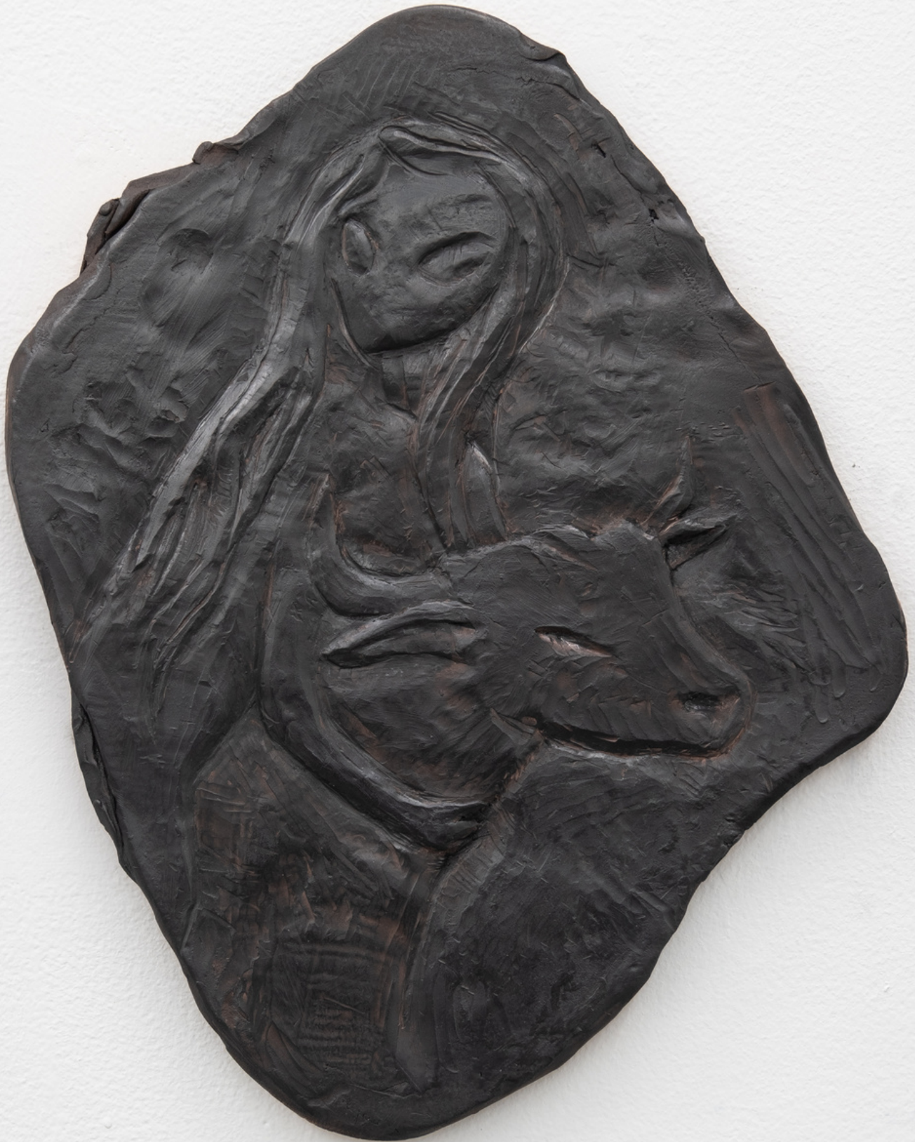
Dimension and Rider, 2024 Terracotta and graphite 11.5 x 14 in