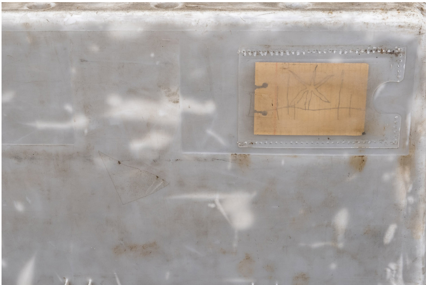
Desk with a View (detail), 2021