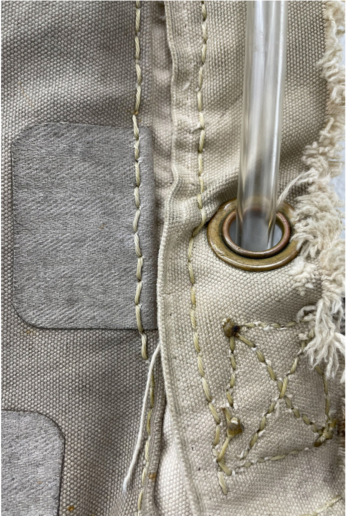
Water Pack (detail), 2021