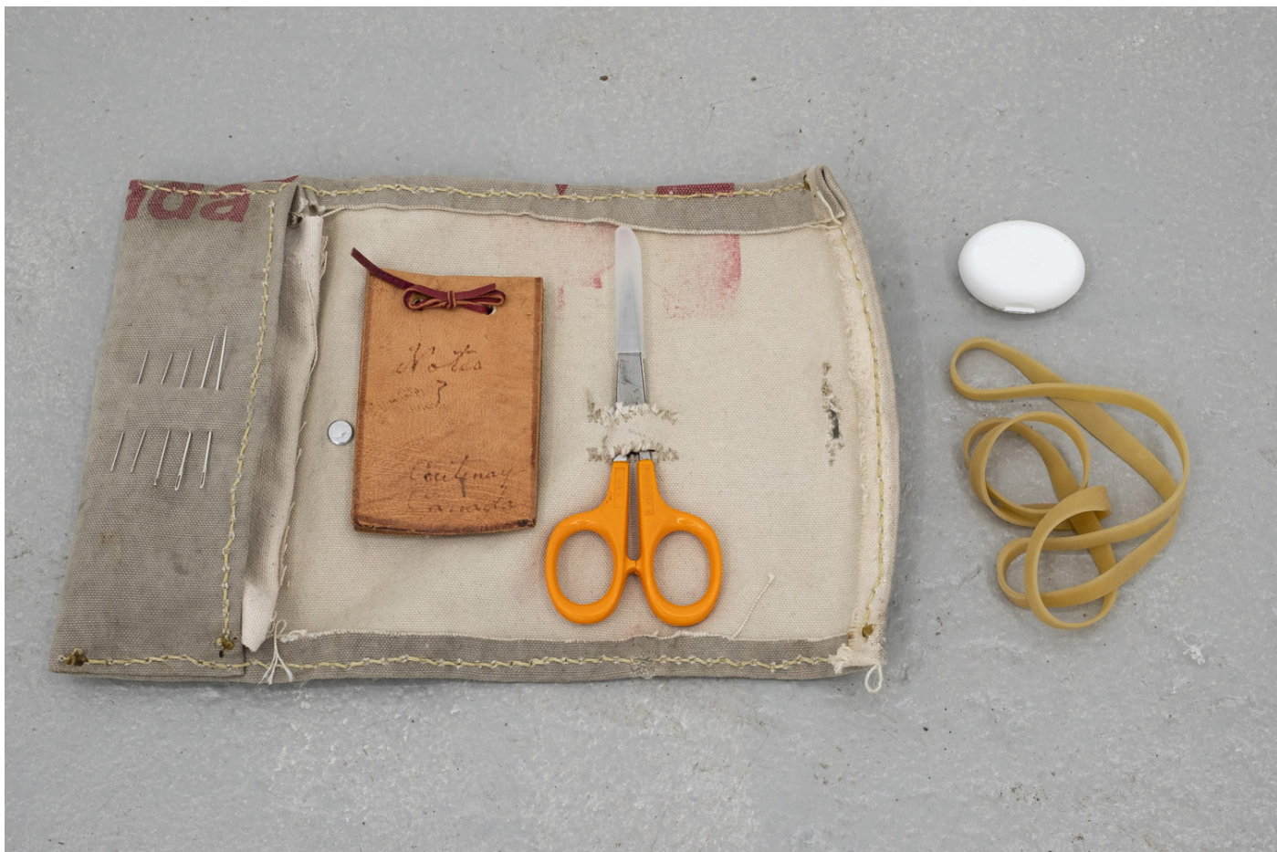
untitled (pouch #2), 2021

hand-sewn canvas relay bags (year unknown), waxed thread, deadstock over-all button, sewing needles, muslin strips, found notebook, scissors, dental floss, found elastics.