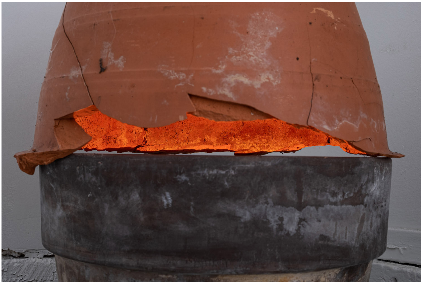
untitled (heater) (detail), 2021