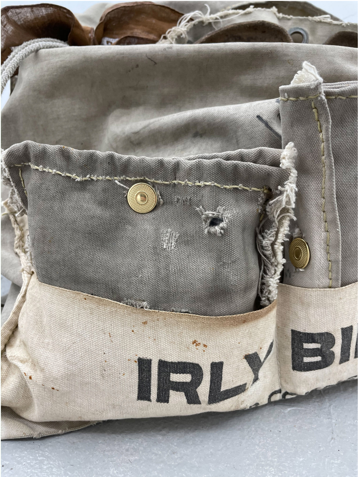
Bag (detail), 2021