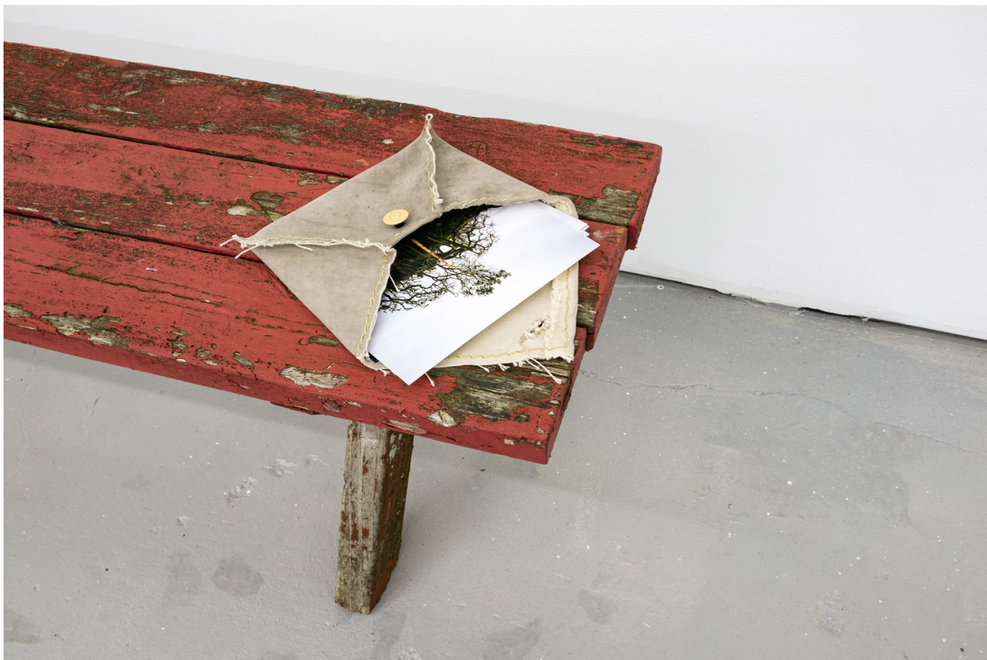
untitled (envelope with photographs) , 2021 hand-sewn canvas relay bags (year unknown), waxed thread, deadstock over-all button, selection of 4 x 6 prints, 6.4 x 5 in.