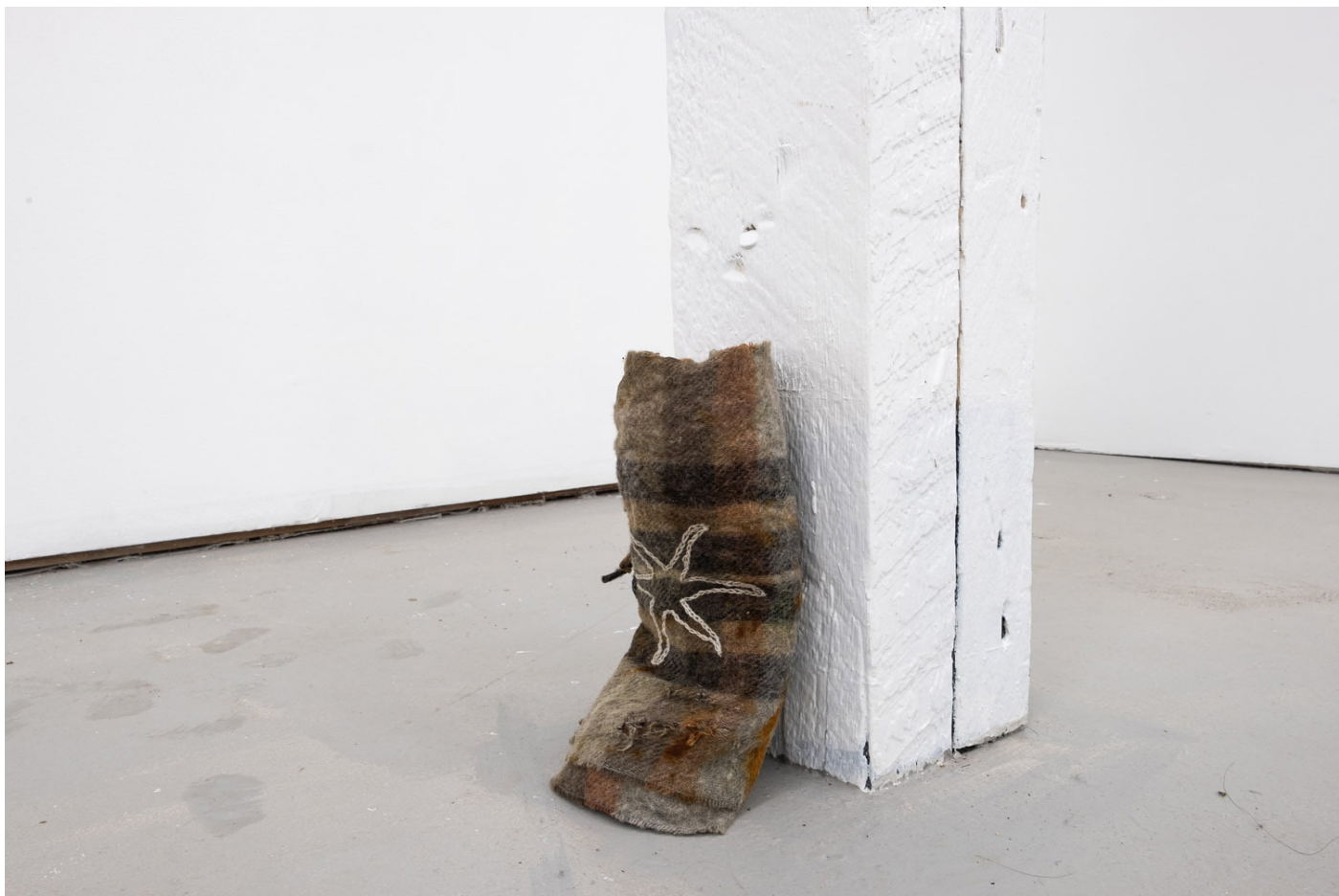
untitled (scarf) , 2021 chain-stitching on found wool scarf, merino wool thread, 3.5 x 16 x 3.3 in.