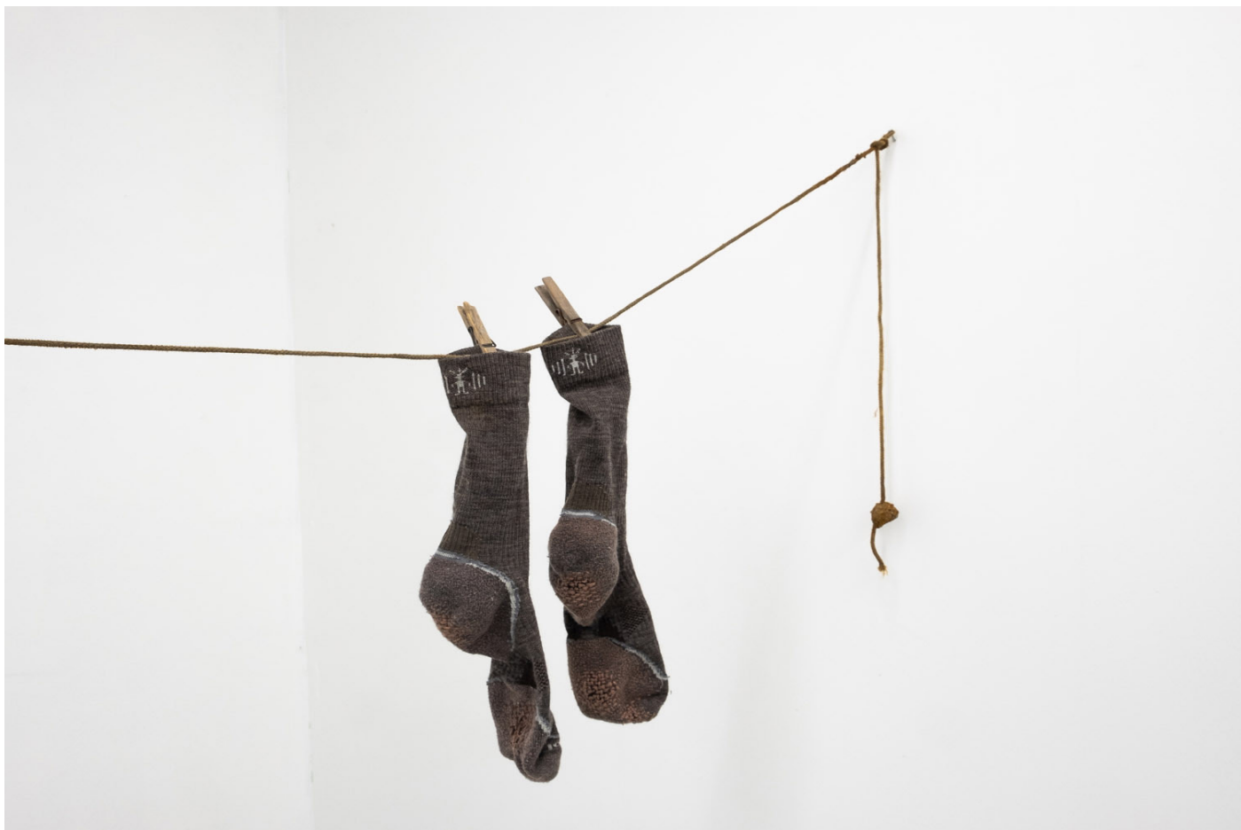
Line Dry (detail), 2021