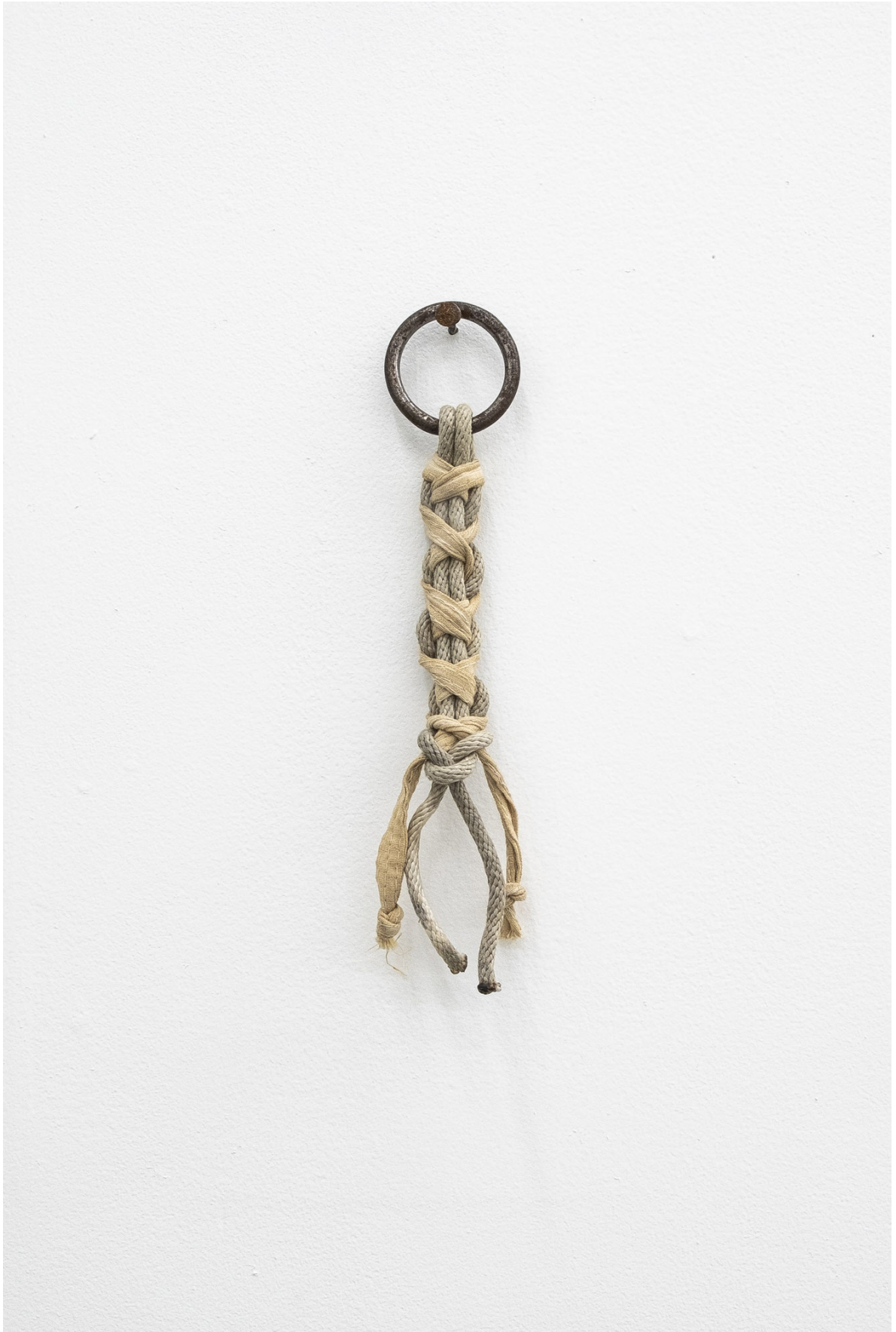
untitled (Bottega bootleg) , 2021

rope, cotton, found steel ring, nail retrieved from flat tire, 2.3 x 10 in.