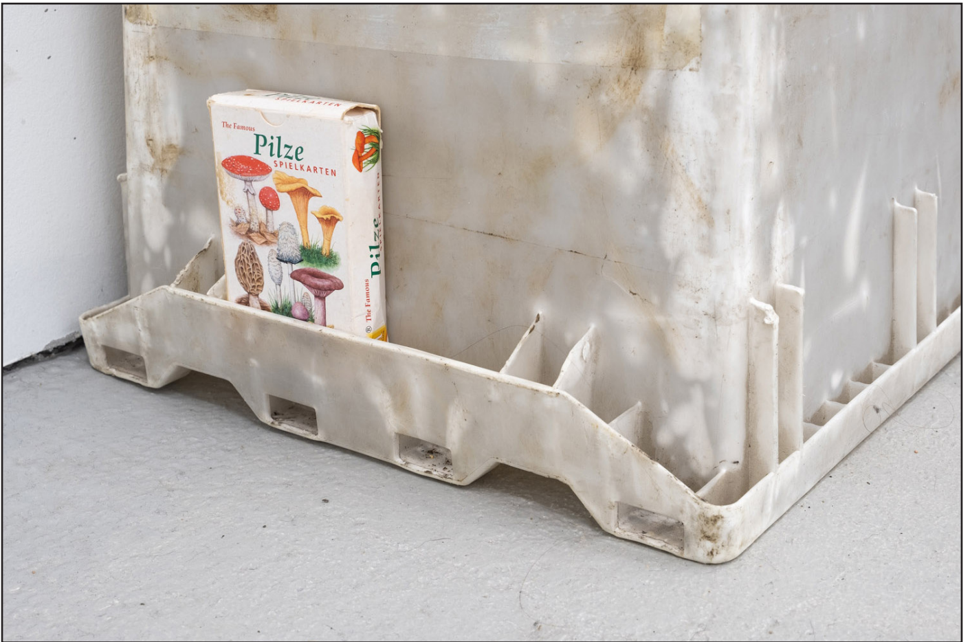
Desk with a View (detail), 2021