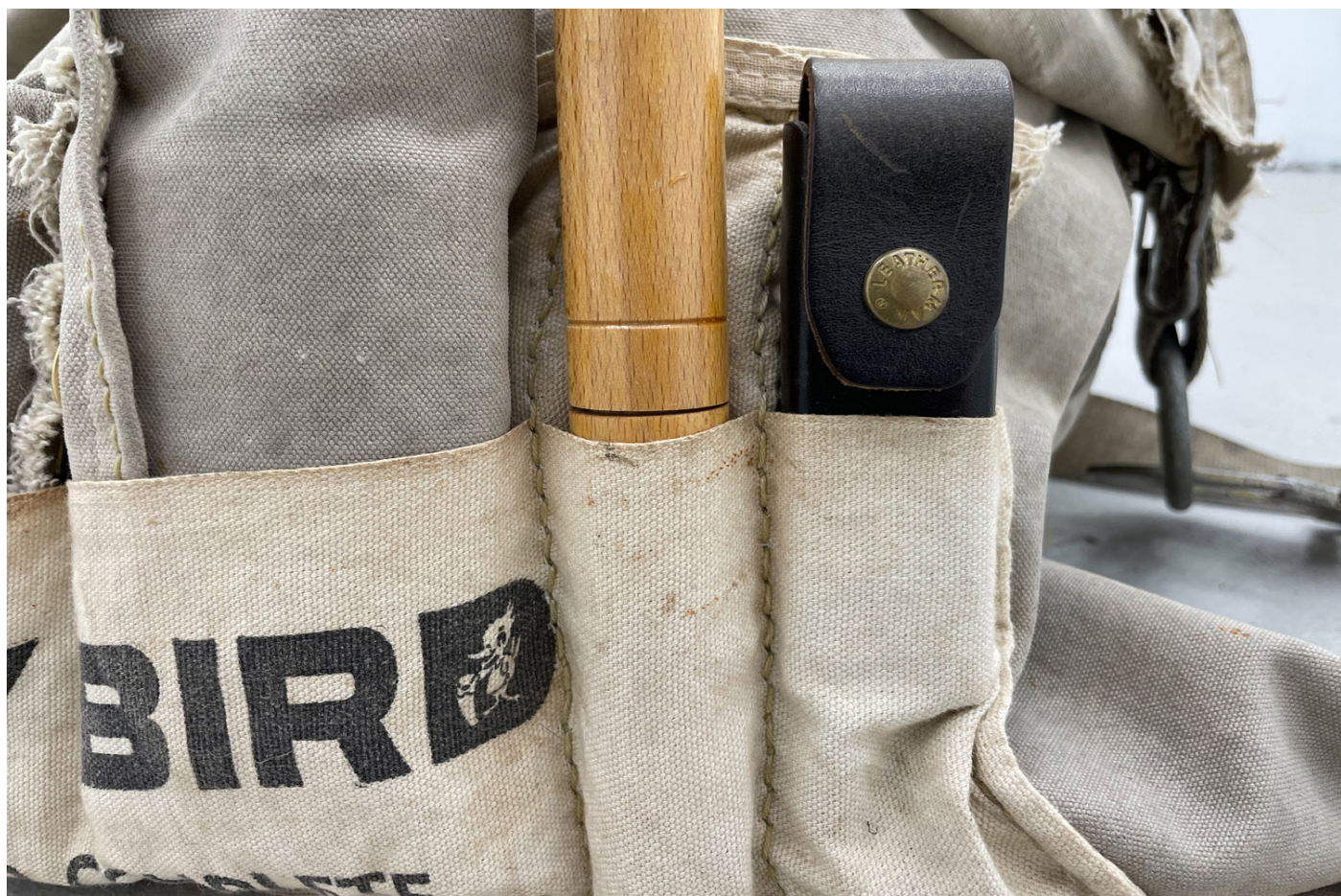
Bag (detail), 2021