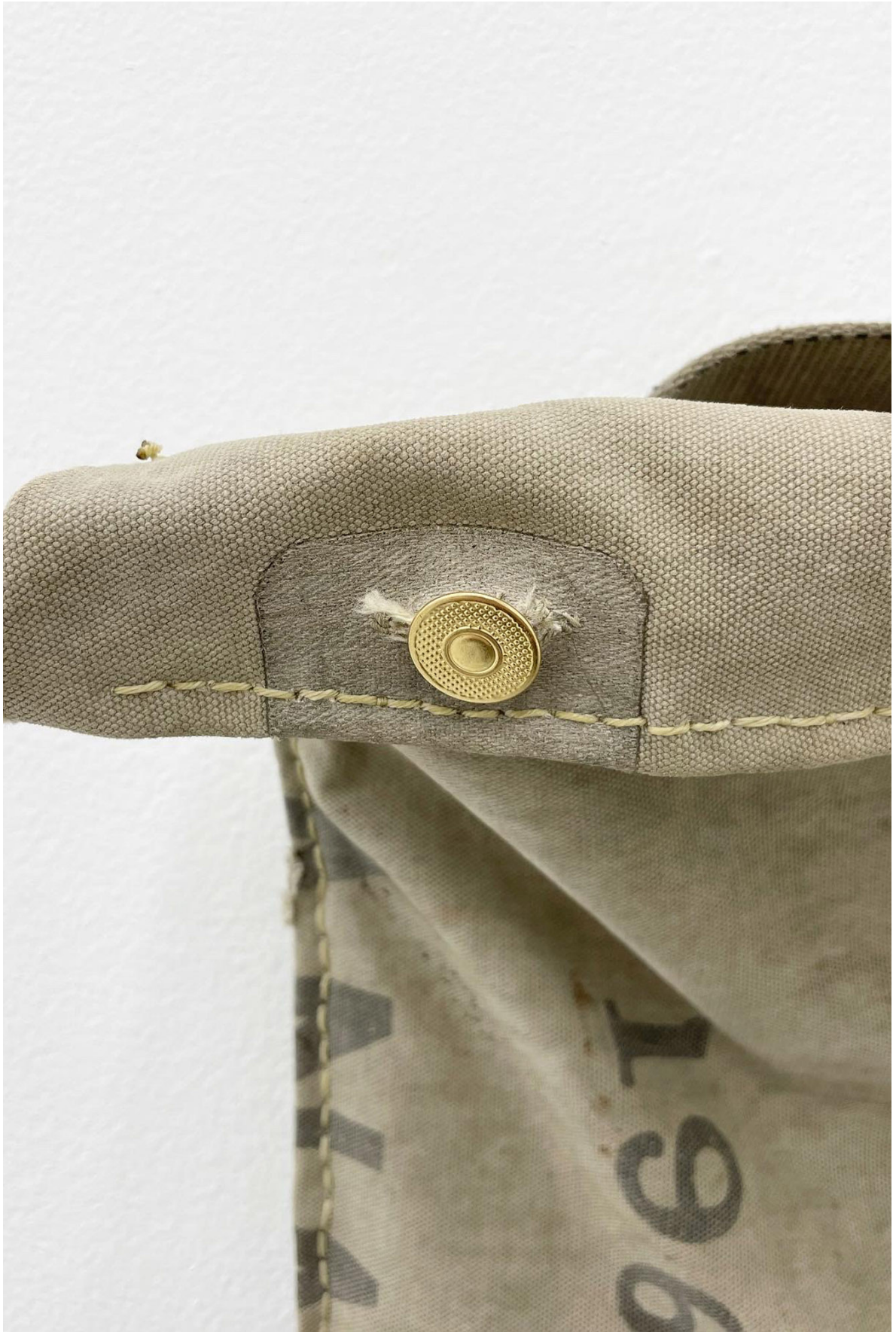
Water Pack (detail), 2021