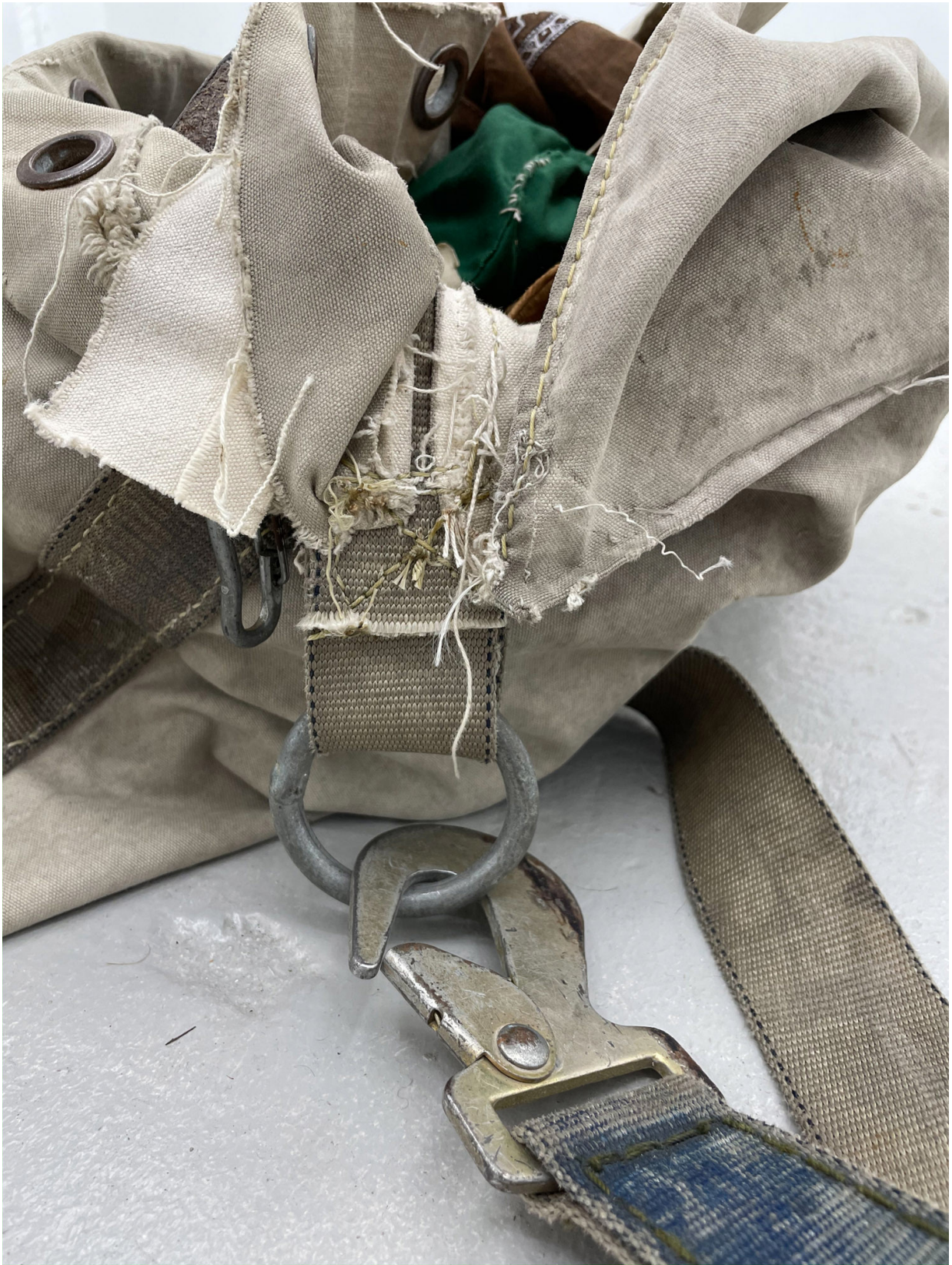
Bag (detail), 2021