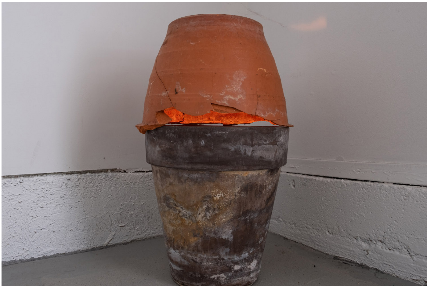
untitled (heater) , 2021 found terracotta pots, gifted beeswax candle, 12 x 12 x 21 in.