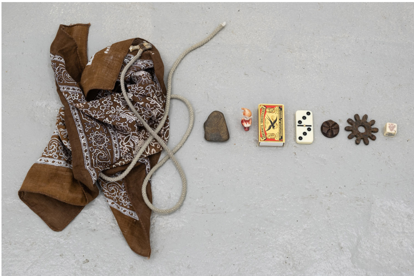
untitled (pouch #4) , 2021

found bandana, rope, worry stone, miniature gnome, matchbox with unfinished starweed charms, gifted domino, wooden button, metal gear, found poker die.