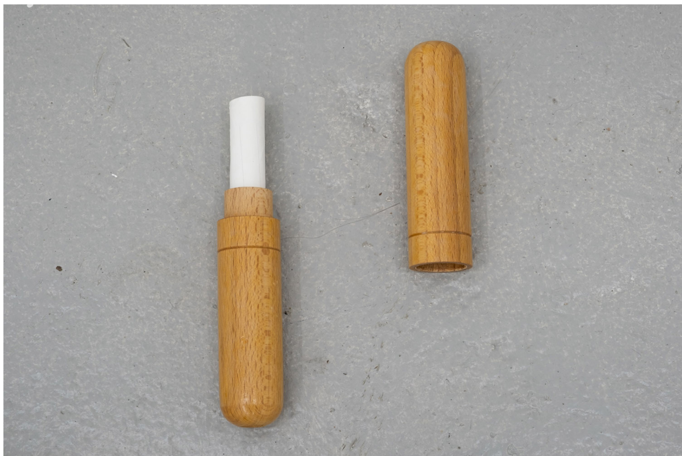
Wooden tube with handwritten poem by Sue Lockhart.