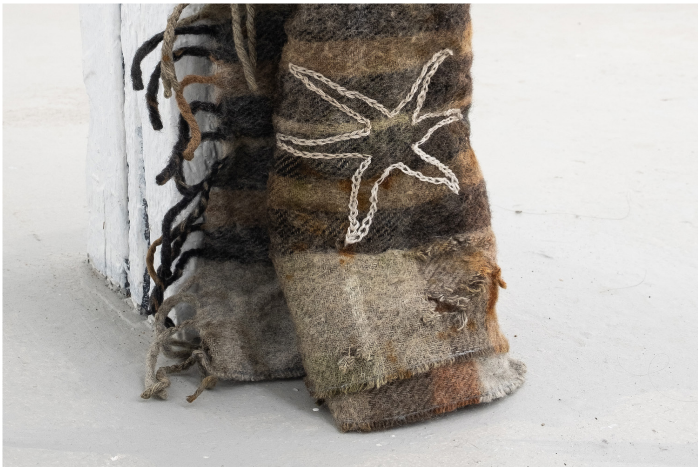
untitled (scarf) (detail), 2021