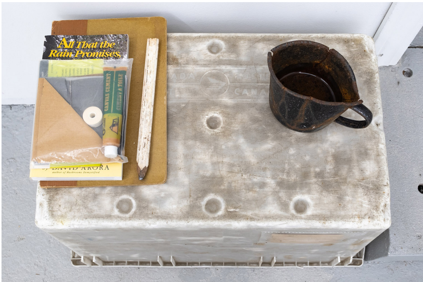
Desk with a View (detail), 2021