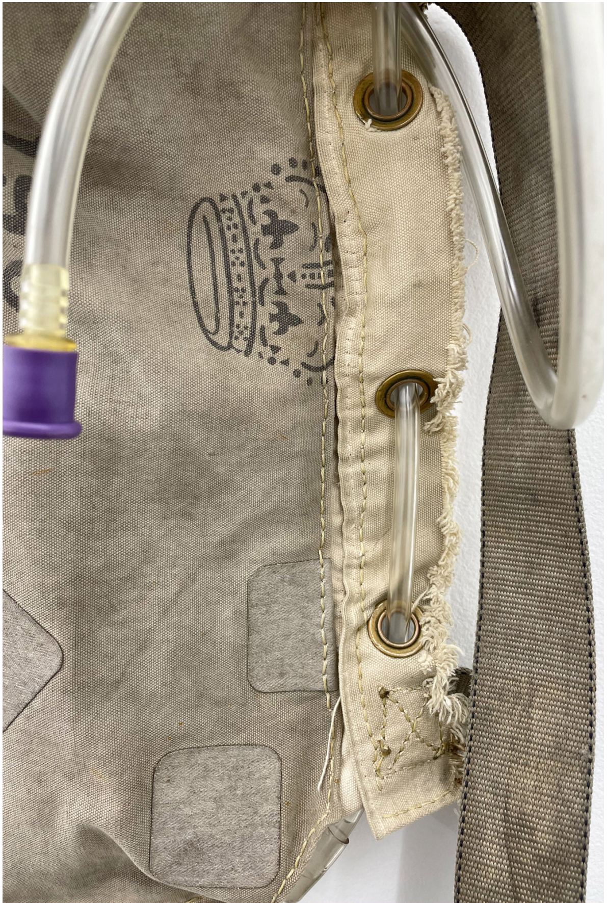
Water Pack (detail), 2021