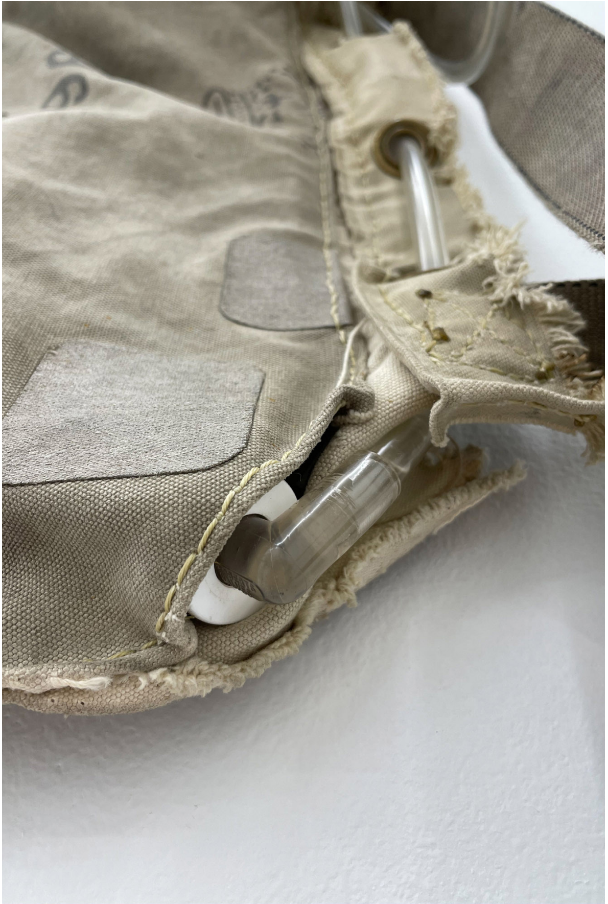
Water Pack (detail), 2021