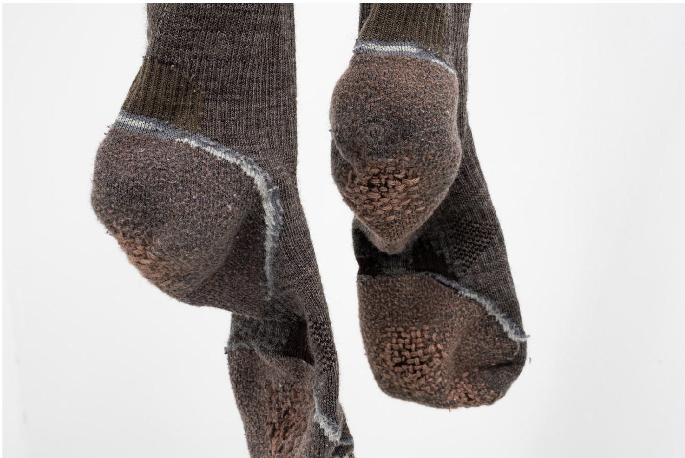
Line Dry (detail), 2021