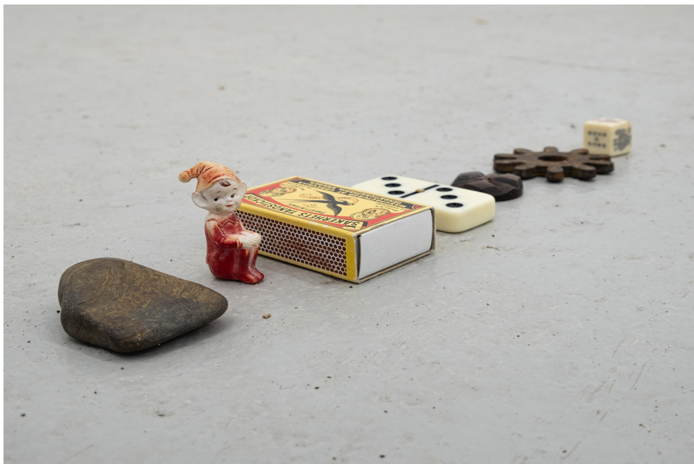
Contents of pouch #4.