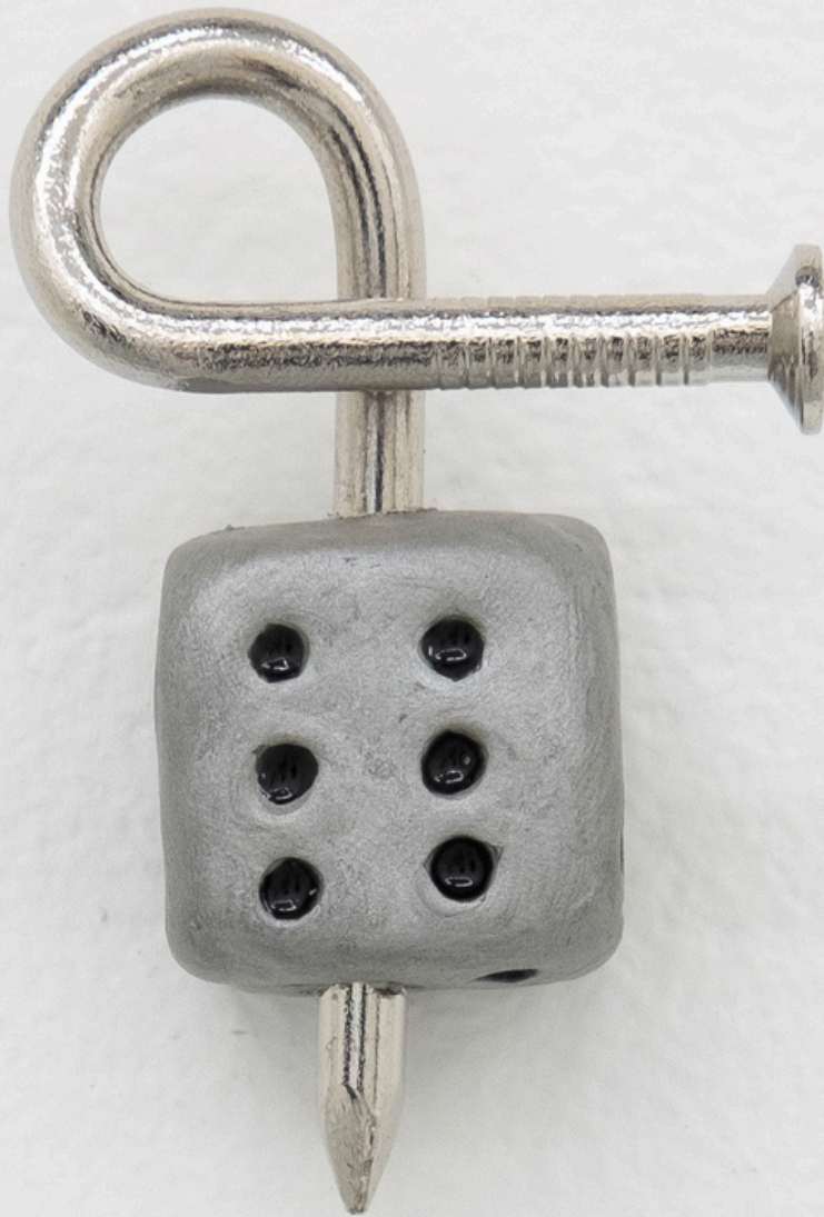
Teaser , 2025 Foam, epoxy, prop nail, enamel paint 2 x 1.5 x 1"