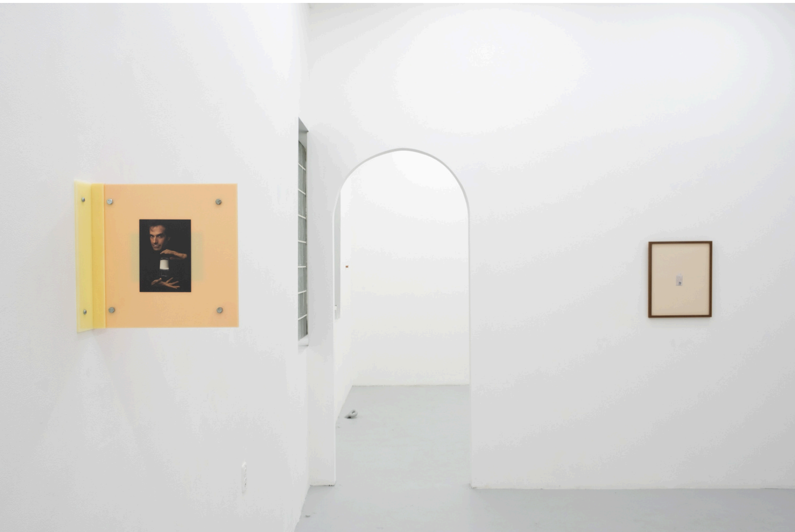
It's Always Been This Way (Got Milk) , 2025