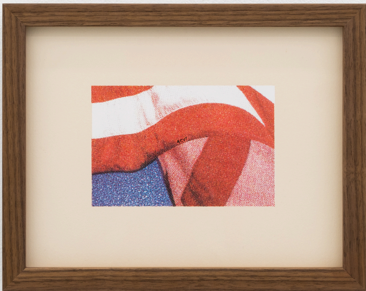
4Evr (Flag) , 2024 Silkscreen on fabriano rosaspina 7 x 9" (5 w 1 AP)