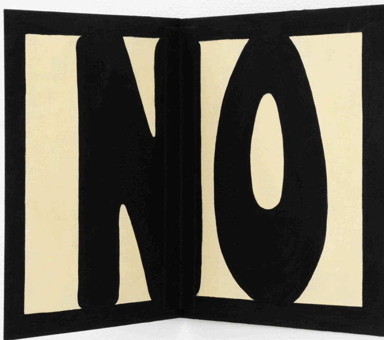
Yes, No, Maybe (recto), 2025 Steel, oil-based enamel, flashe 13.5 x 8 x 6"