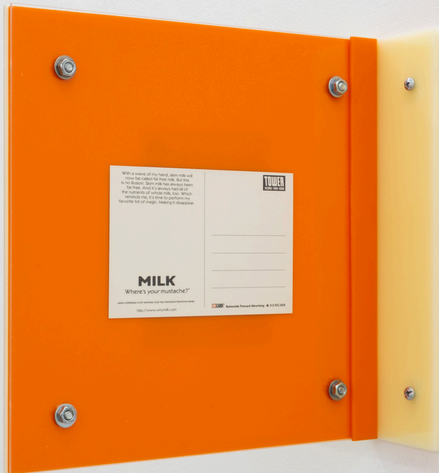
It's Always Been This Way (Got Milk), 2025