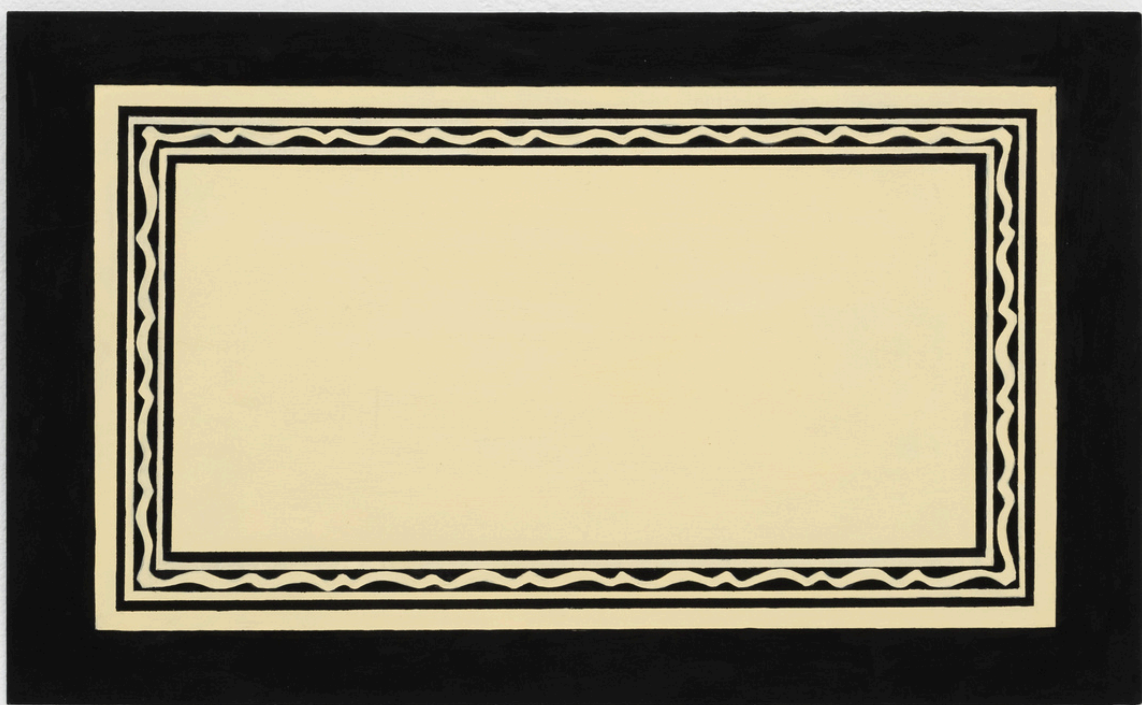
Yes, No, Maybe (verso), 2025 Steel, oil-based enamel, flashe 13.5 x 8"