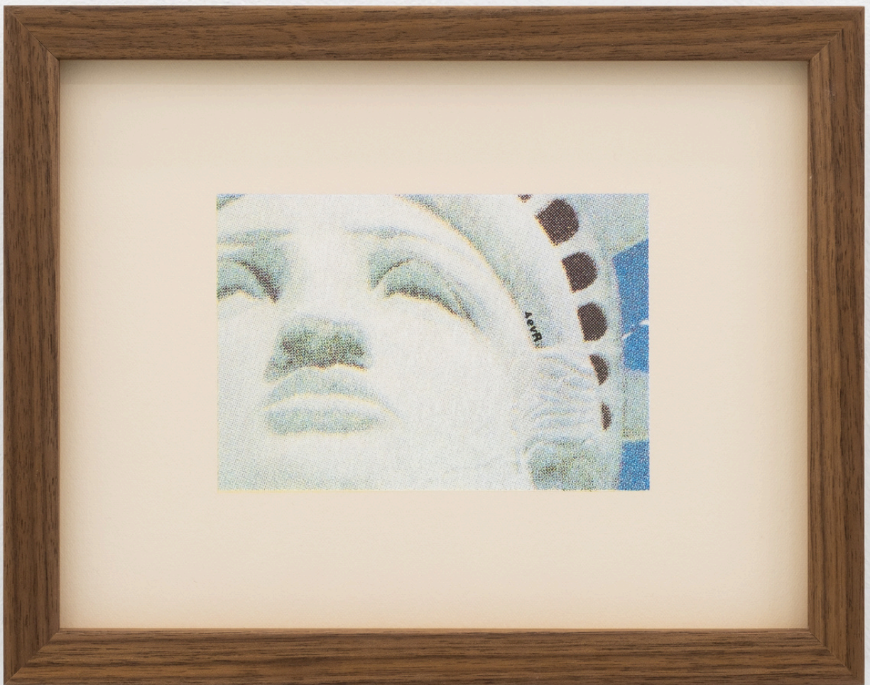
4Evr (His Own Creation) , 2024 Silkscreen on fabriano rosaspina 7 x 9" (5 w 1 AP)