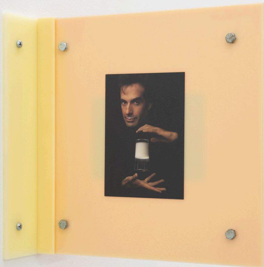
It's Always Been This Way (Got Milk) , 2025 Acrylic, postcards, hardware 12 x 6 x 12"