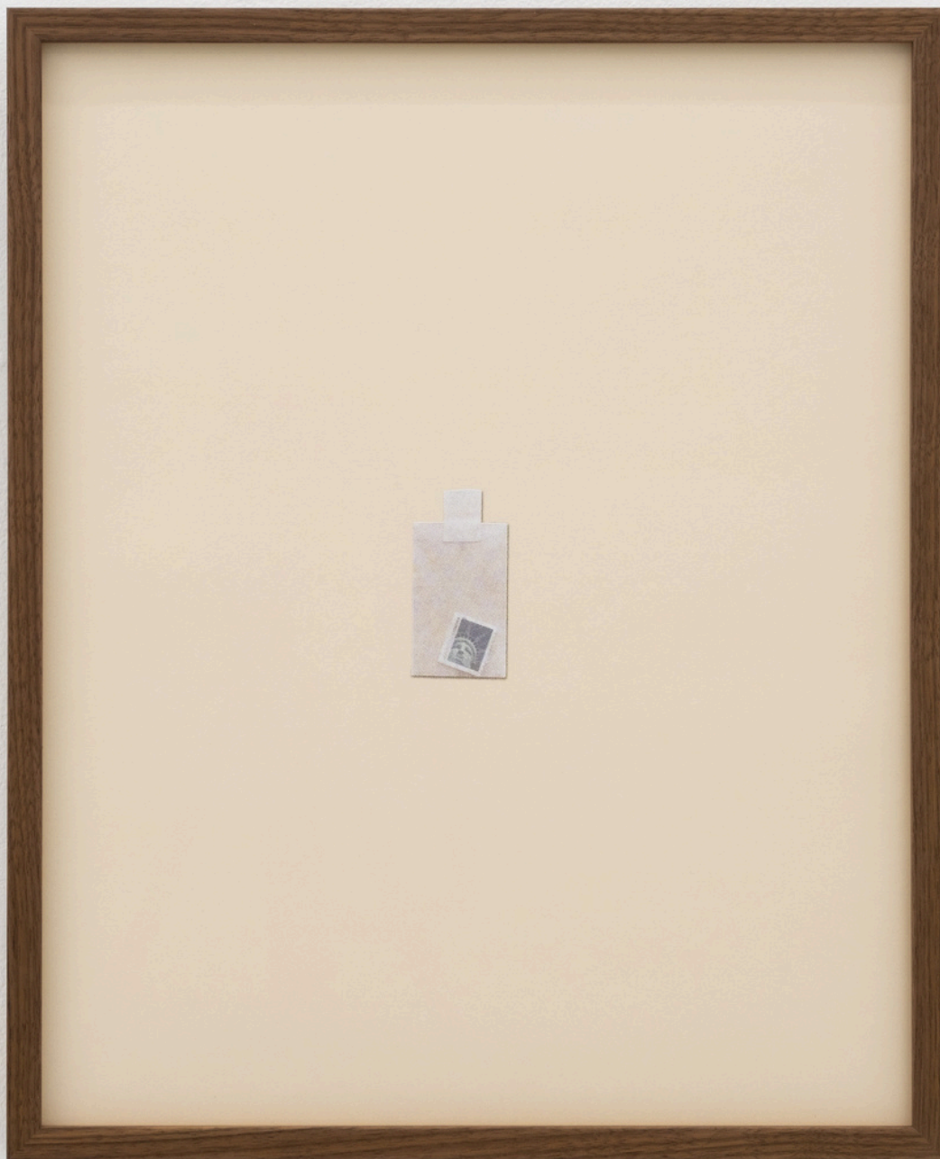
The Exhibit (Fresh-faced, Sultry, Modern) , 2024 Silkscreen on fabiano rosaspina 20 x 16" (5 w 1 AP)