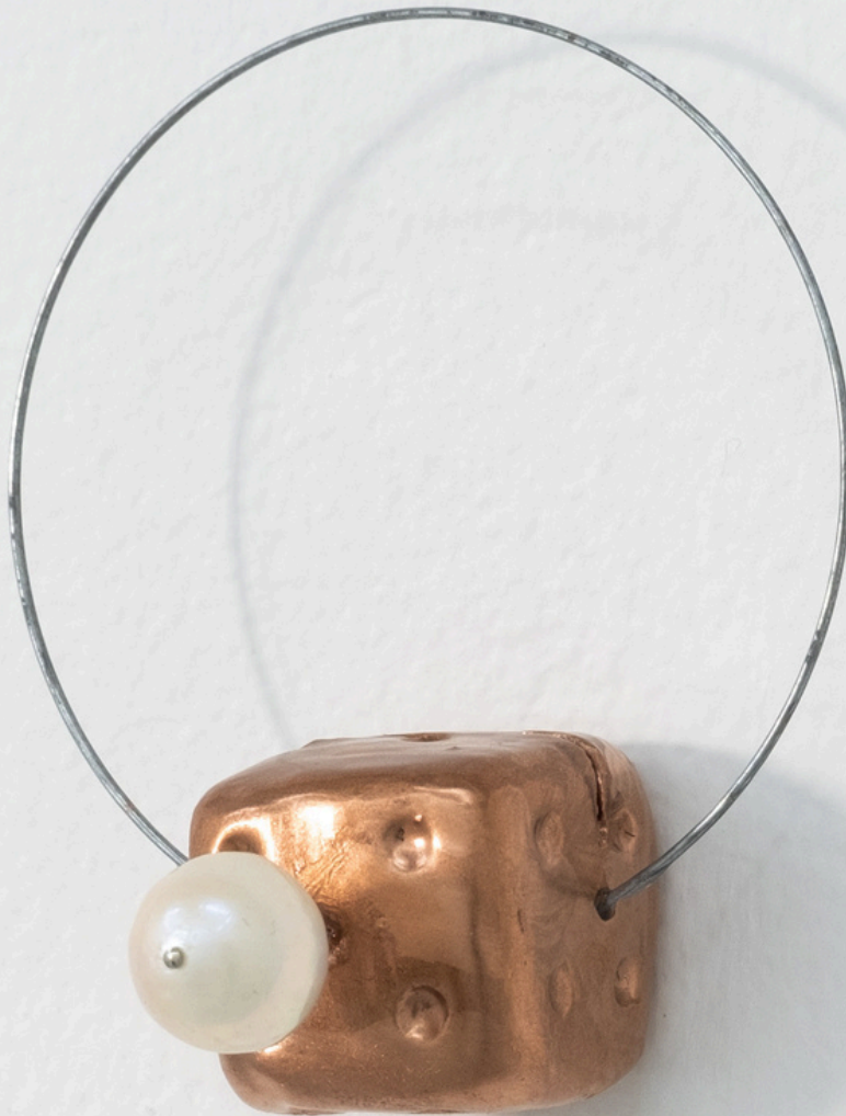
(Enchanted Ring) , 2025

Foam, epoxy, wire, pin, freshwater pearl, enamel paint 3 x 3 x 1.5"