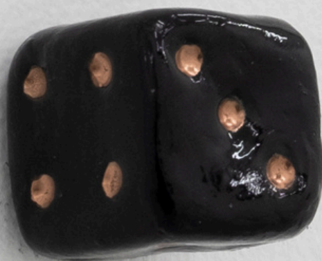
Untitled, 2025 Foam, epoxy, enamel paint 1 x 1 x 1"