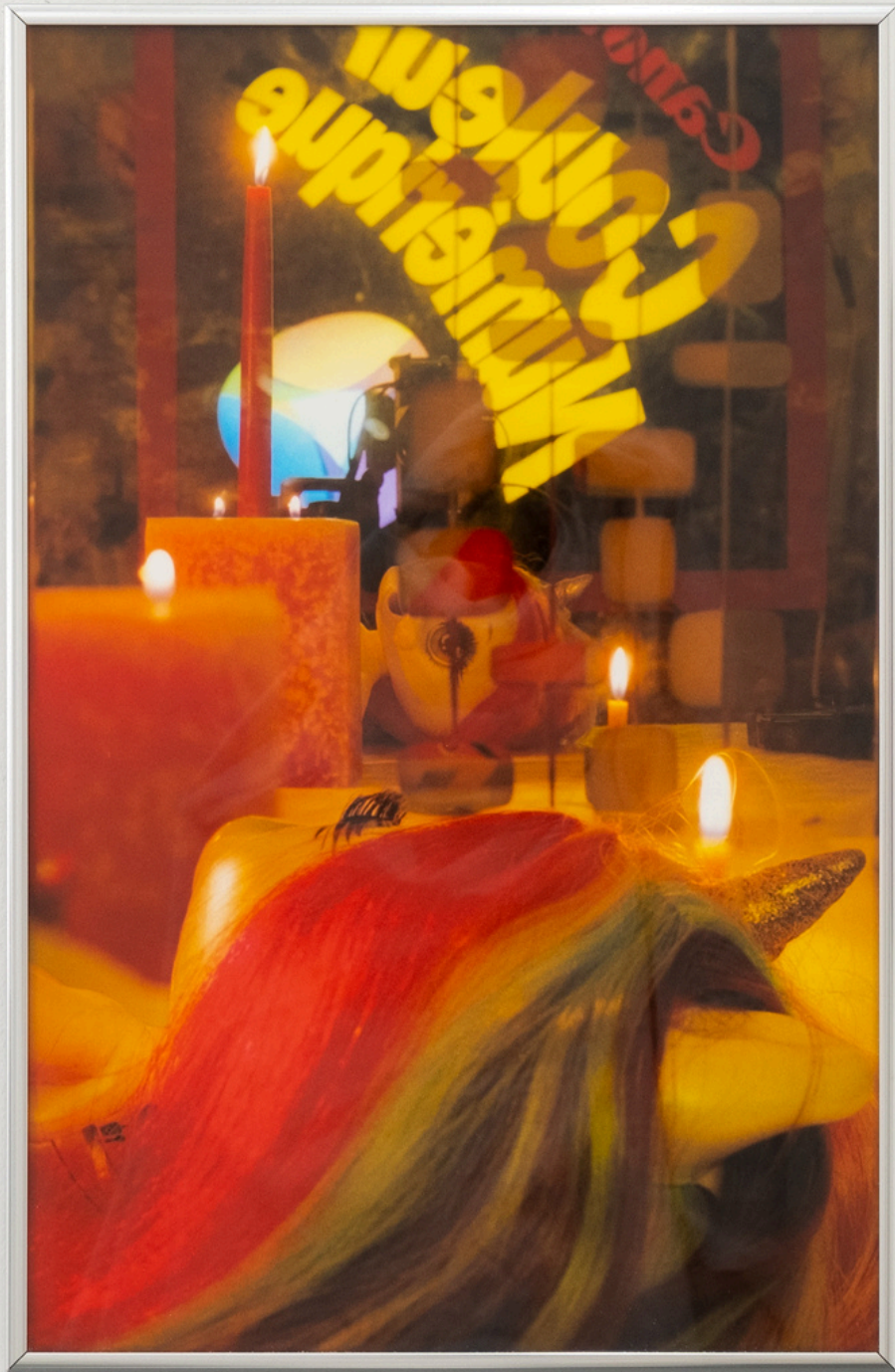
Poupée's Pleasures , 2024 Archival inkjet print 11 x 17" / 27.9 x 43.1 cm (framed)