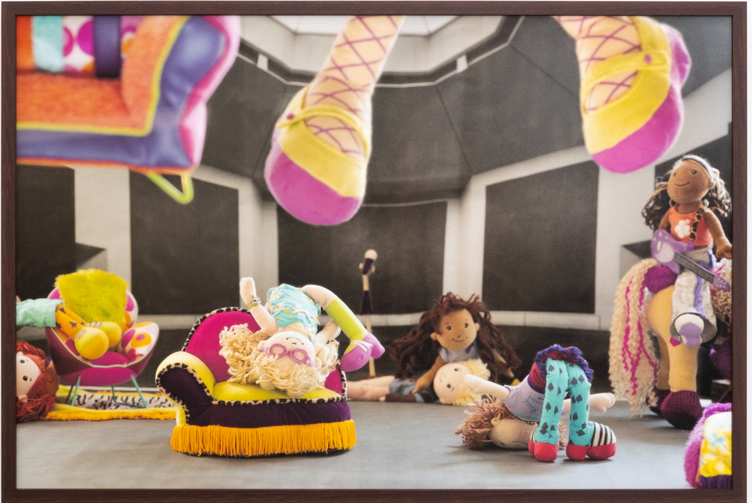
Groovyworld , 2024 Archival inkjet print 32 x 48" / 81.2 x 121.9cm (framed)