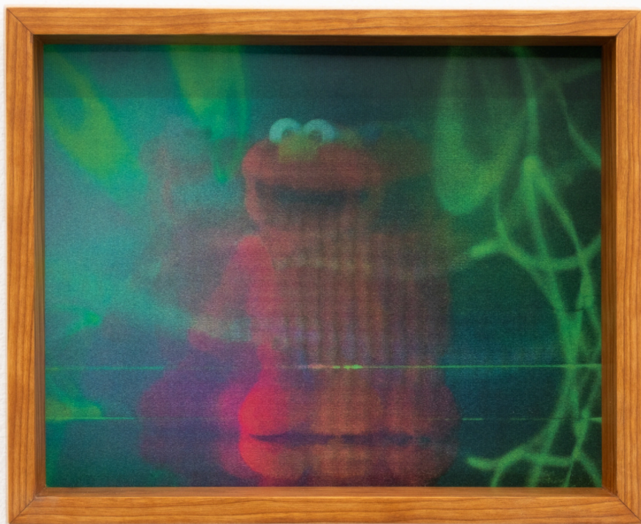
Beau Travail Elmo, 2024 3-flip Lenticular print 8 x 10" / 20.3 x 25.4 cm (framed)