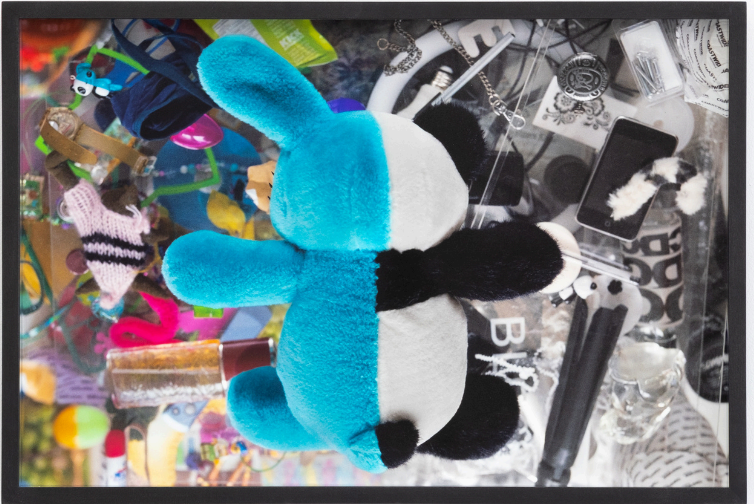
Doublesided-Tripledecker (4 Easy Pieces), 2024 Archival inkjet print 24 x 16" / 60.9 x 40.6 cm (framed)