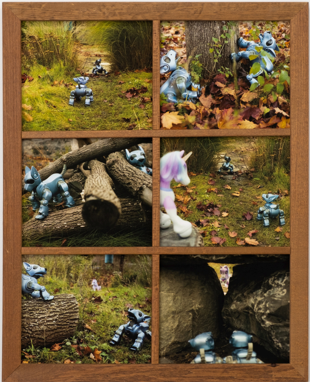
Stills (Raiders of the Golden Cybie), 2023, Dir. Sabiri & Assadourian, 2023 Archival inkjet prints 24.5 x 30.5" / 62.2 x 77.4 cm (framed)