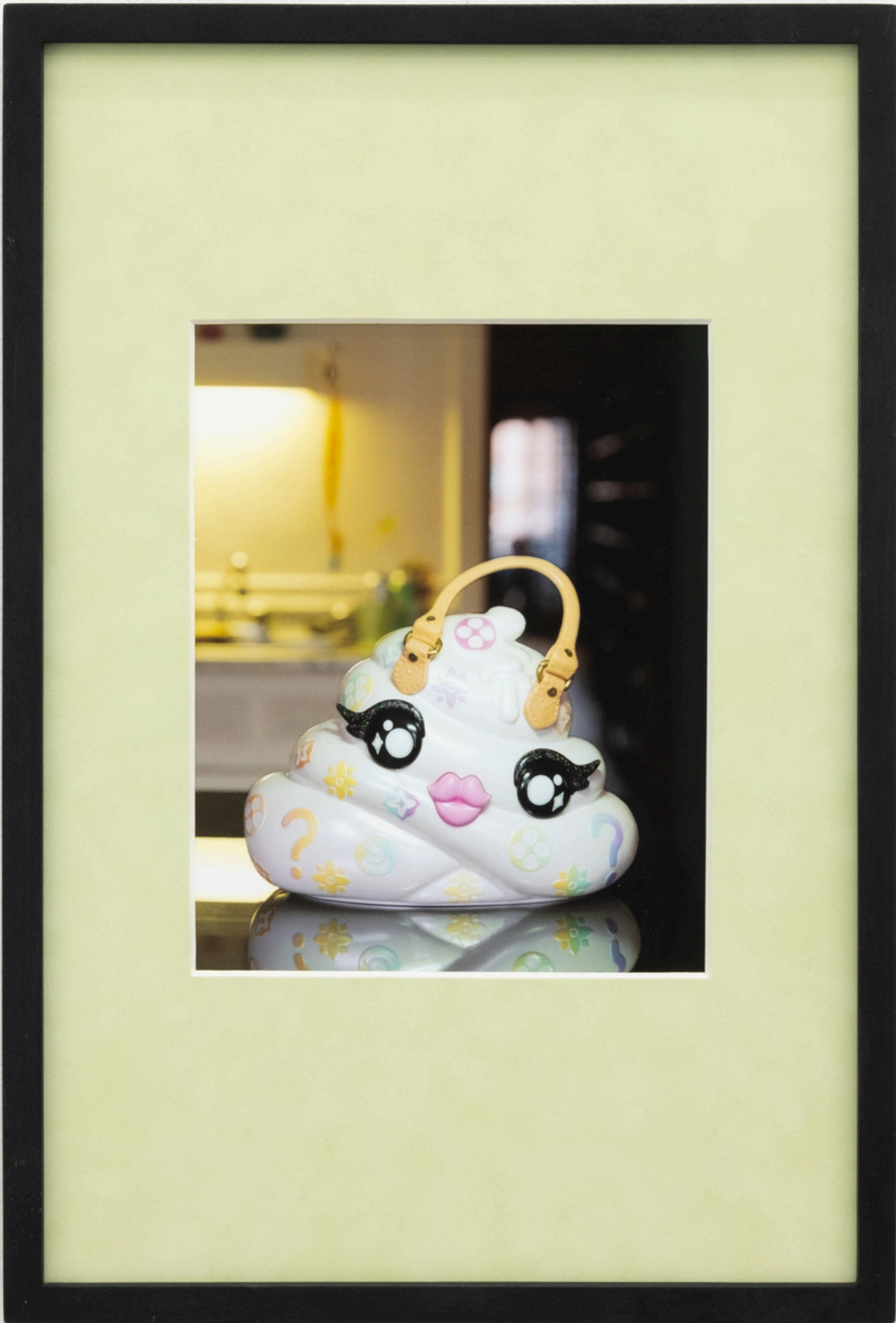
Marc, 2023 Archival inkjet print 10 x 15" / 25.4 x 38.1cm (framed)