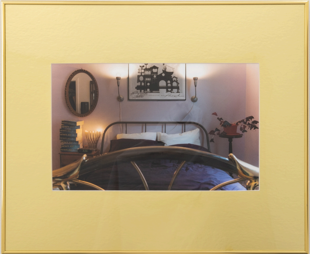
My Adult Bedroom, 2024 Archival inkjet print 22 x 26" / 55.8 x 66 cm (framed)